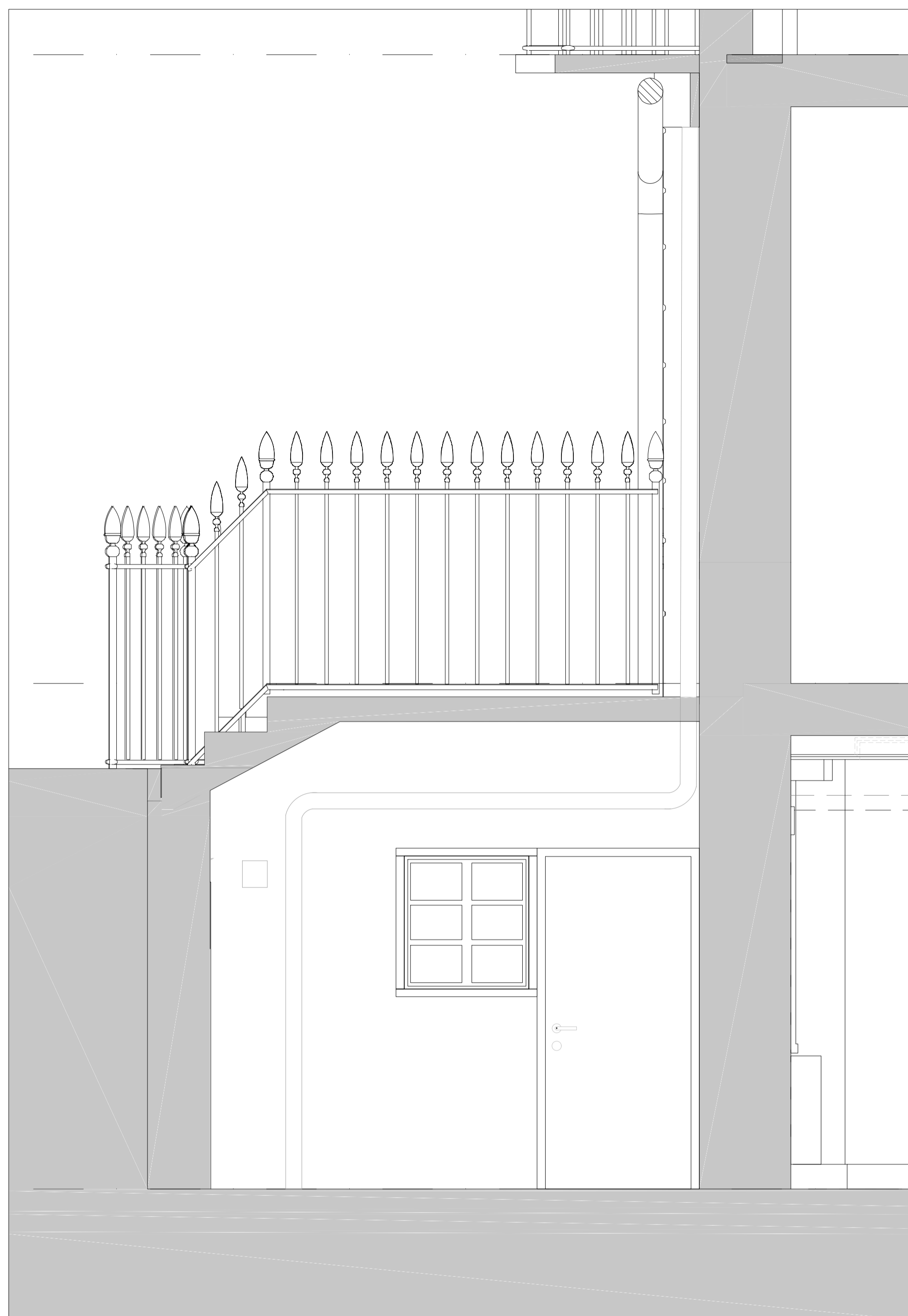
EXISTING Section Scale 1:20

THIS DRAWING IS TO BE READ IN CONJUNCTION WITH ALL RELEVANT STRUCTURAL ENGINEERS AND MECHANICAL AND ELECTRICAL ENGINEERS DRAWINGS, DETAILS AND SPECIFICATIONS.