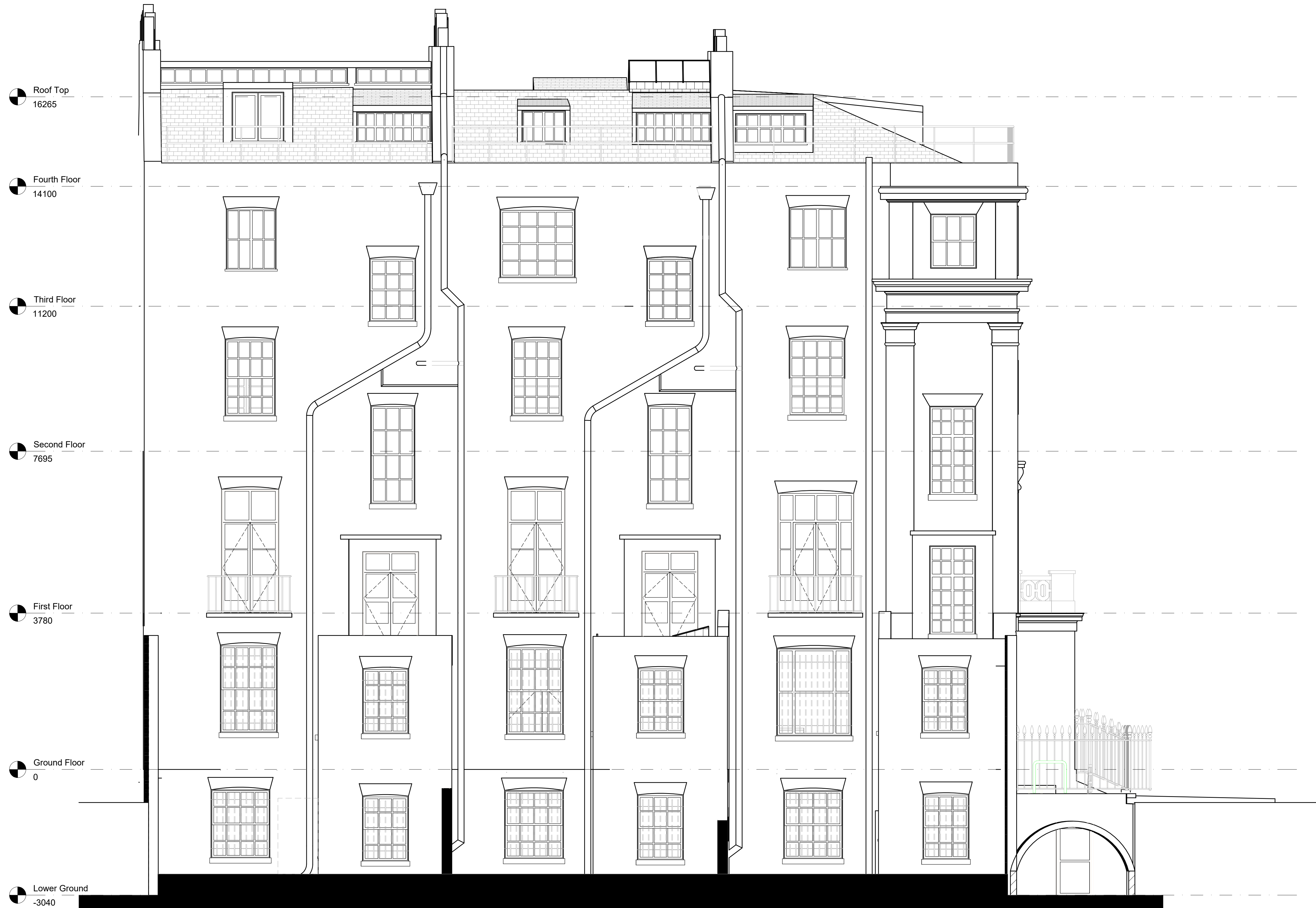
EXISTING REAR ELEVATION (North-East Elevation) Scale 1:50

THIS DRAWING IS TO BE READ IN CONJUNCTION WITH ALL RELEVANT STRUCTURAL ENGINEERS AND MECHANICAL AND ELECTRICAL ENGINEERS DRAWINGS, DETAILS AND SPECIFICATIONS.