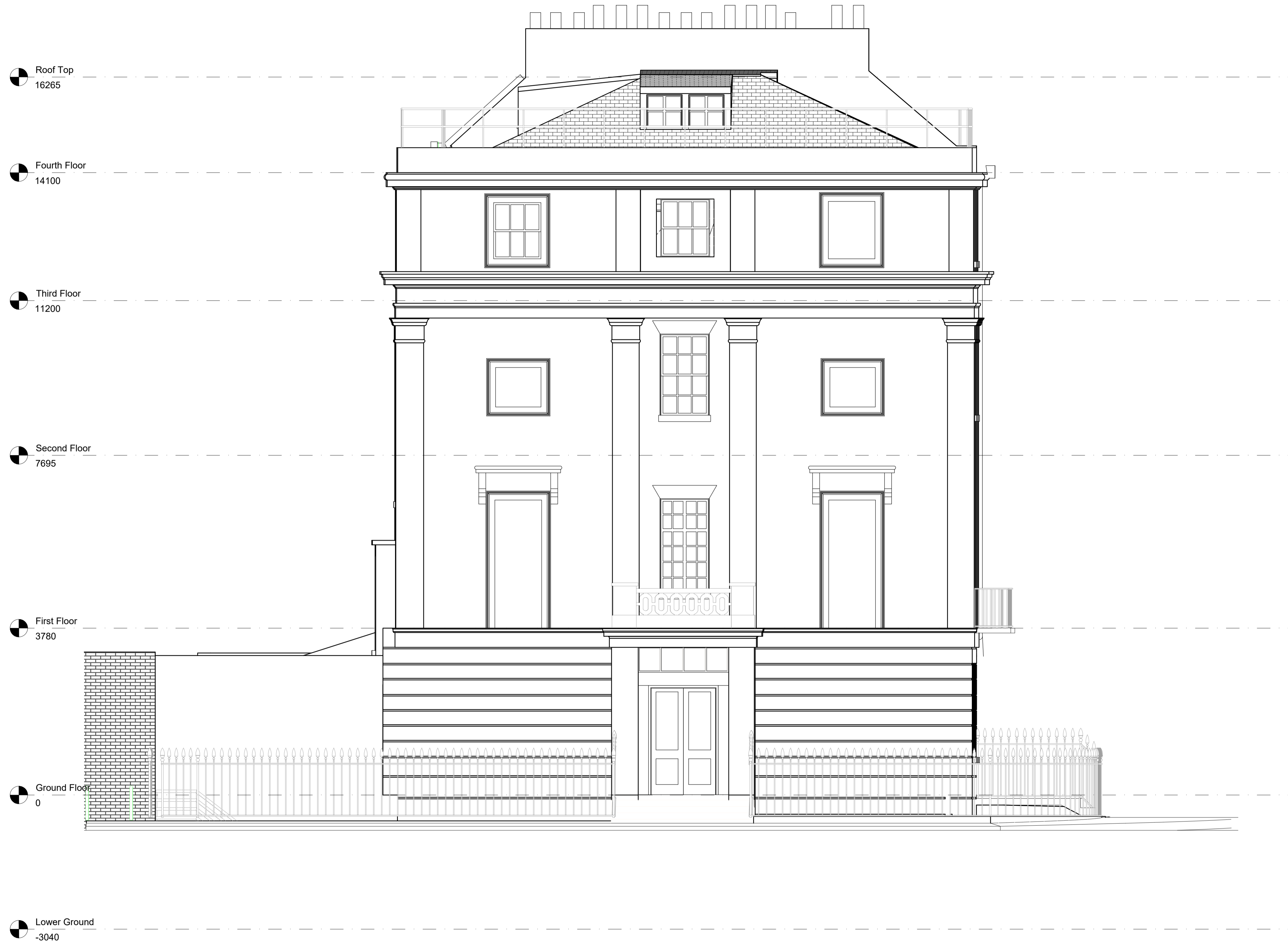
EXISTING SIDE ELEVATION (North-West Elevation) Scale 1:50

THIS DRAWING IS TO BE READ IN CONJUNCTION WITH ALL RELEVANT STRUCTURAL ENGINEERS AND MECHANICAL AND ELECTRICAL ENGINEERS DRAWINGS, DETAILS AND SPECIFICATIONS.