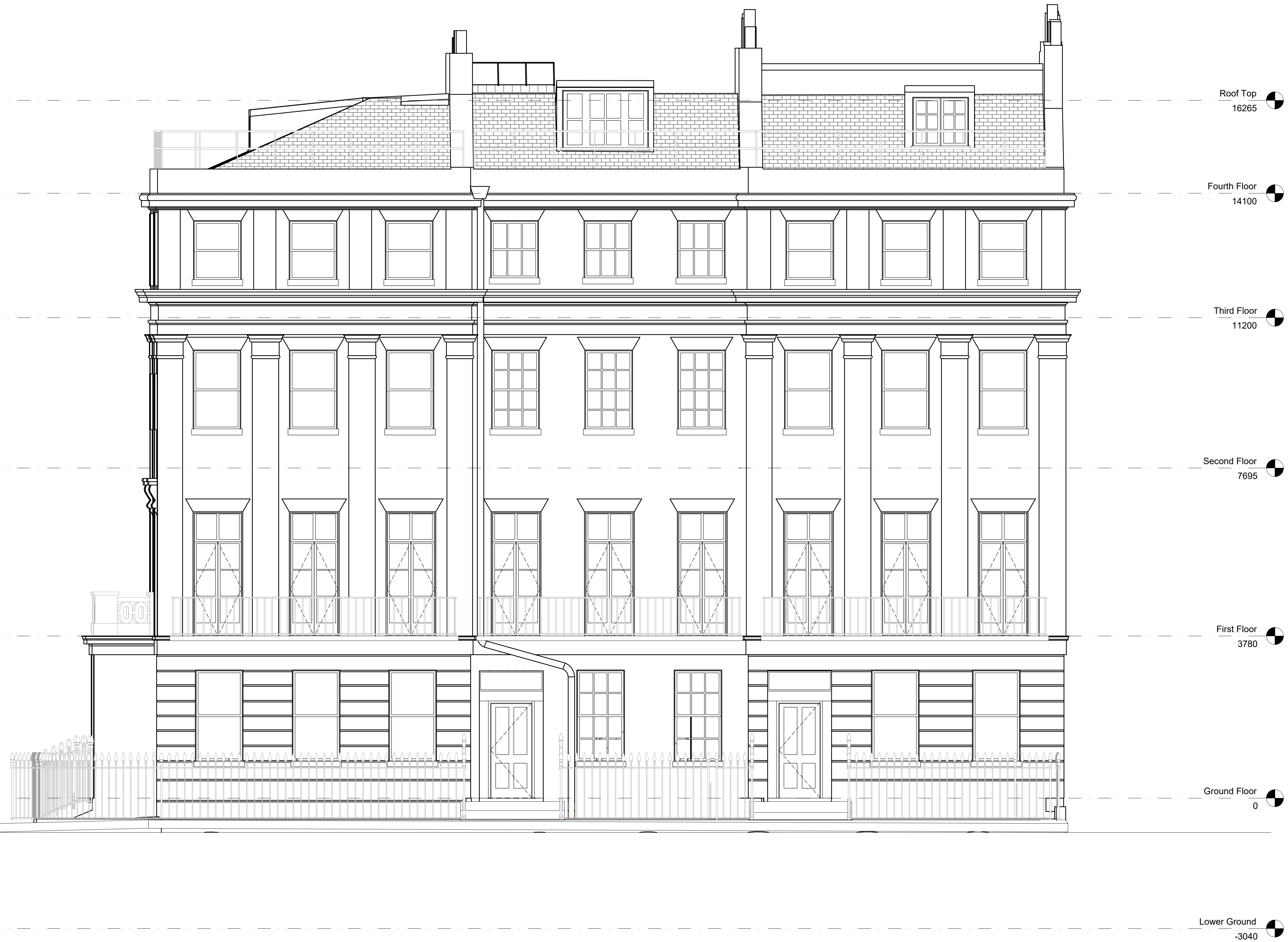
EXISTING FRONT ELEVATION (South-West Elevation) Scale 1:50

THIS DRAWING IS TO BE READ IN CONJUNCTION WITH ALL RELEVANT STRUCTURAL ENGINEERS AND MECHANICAL AND ELECTRICAL ENGINEERS DRAWINGS, DETAILS AND SPECIFICATIONS.