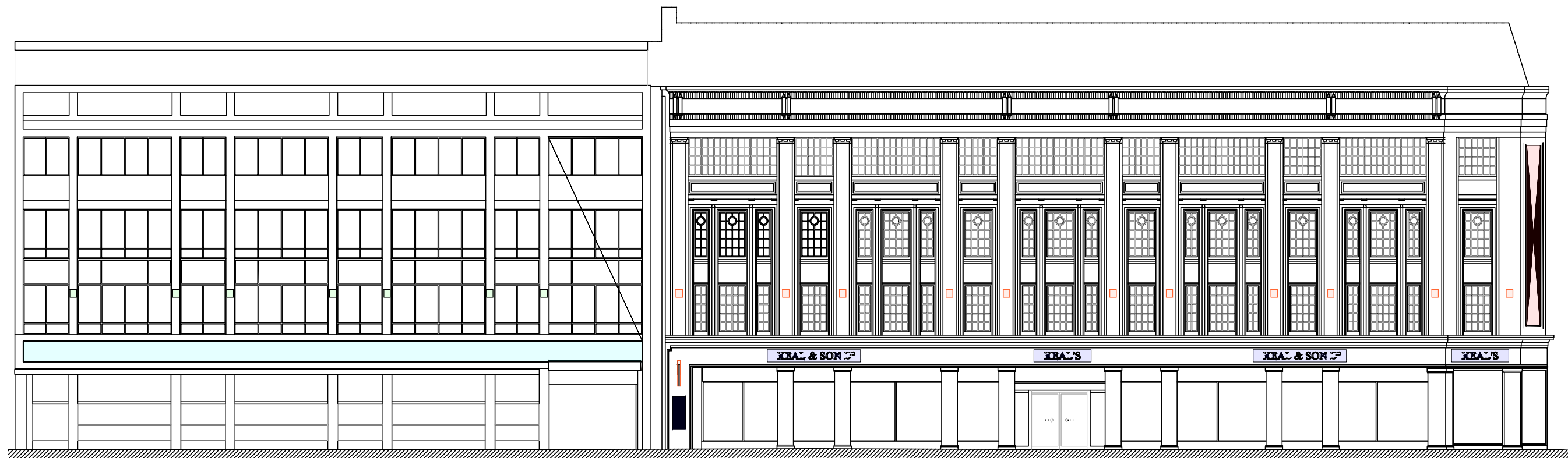
Existing Tottenham Court Road Elevation Scale 1:200