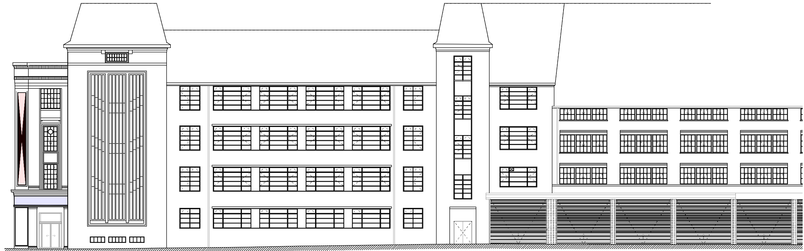
Existing Alfred Mews Elevation Scale 1:200