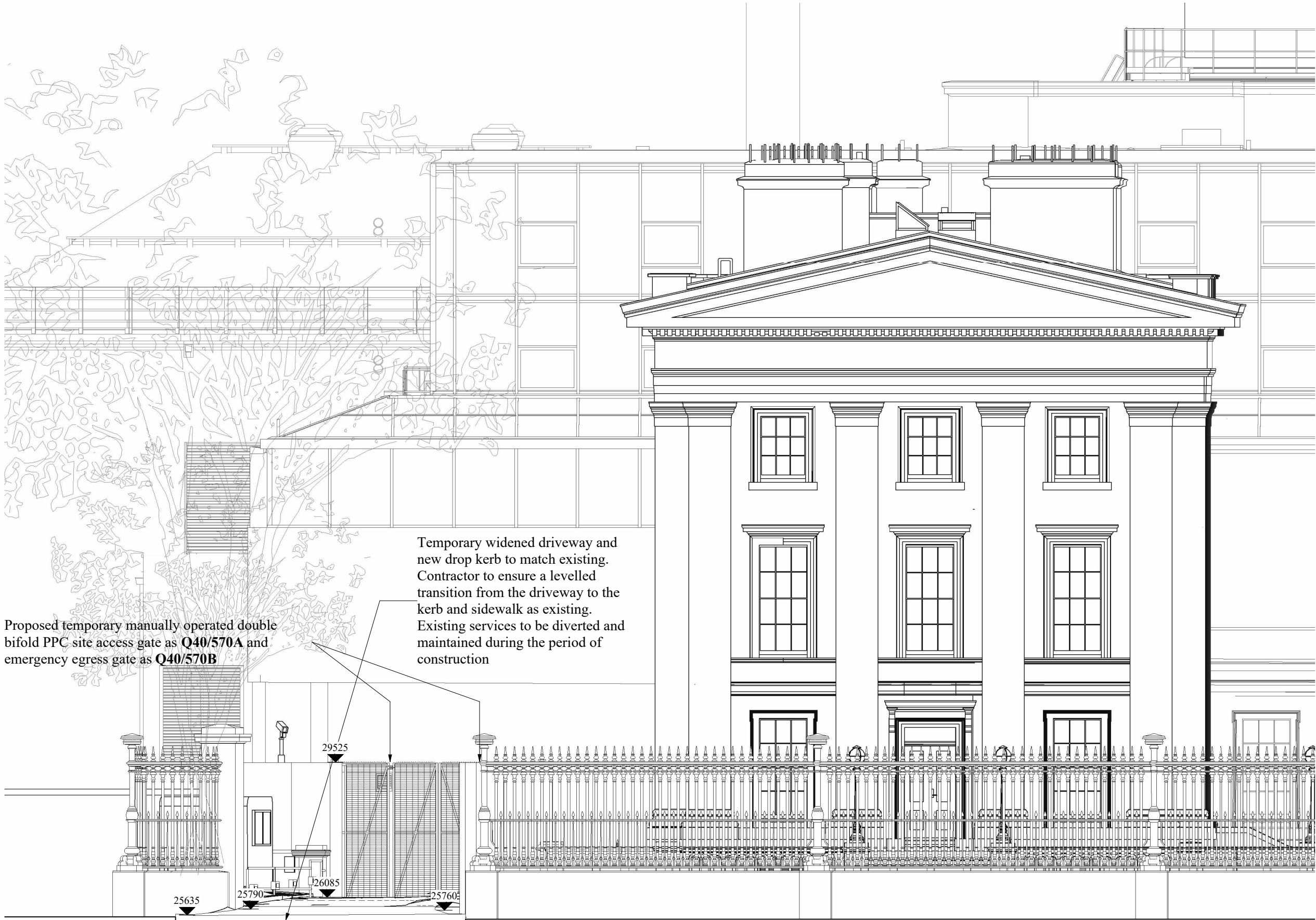
Enabling Works South West Gate Elevation - Proposed Temporary 3 Construction Access 1 : 100