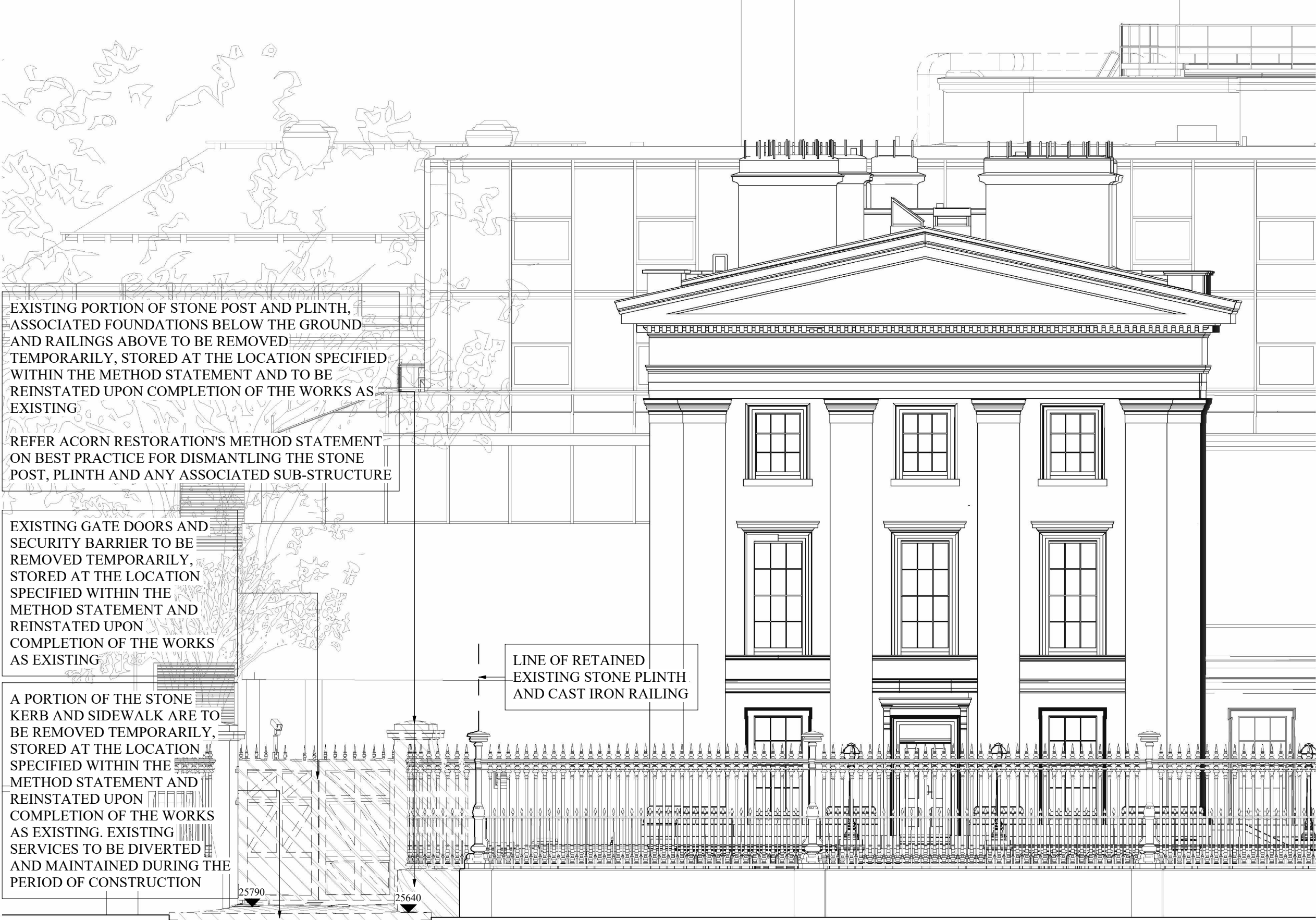
2 Enabling Works South West Gate Elevation - Demolition 1 : 100