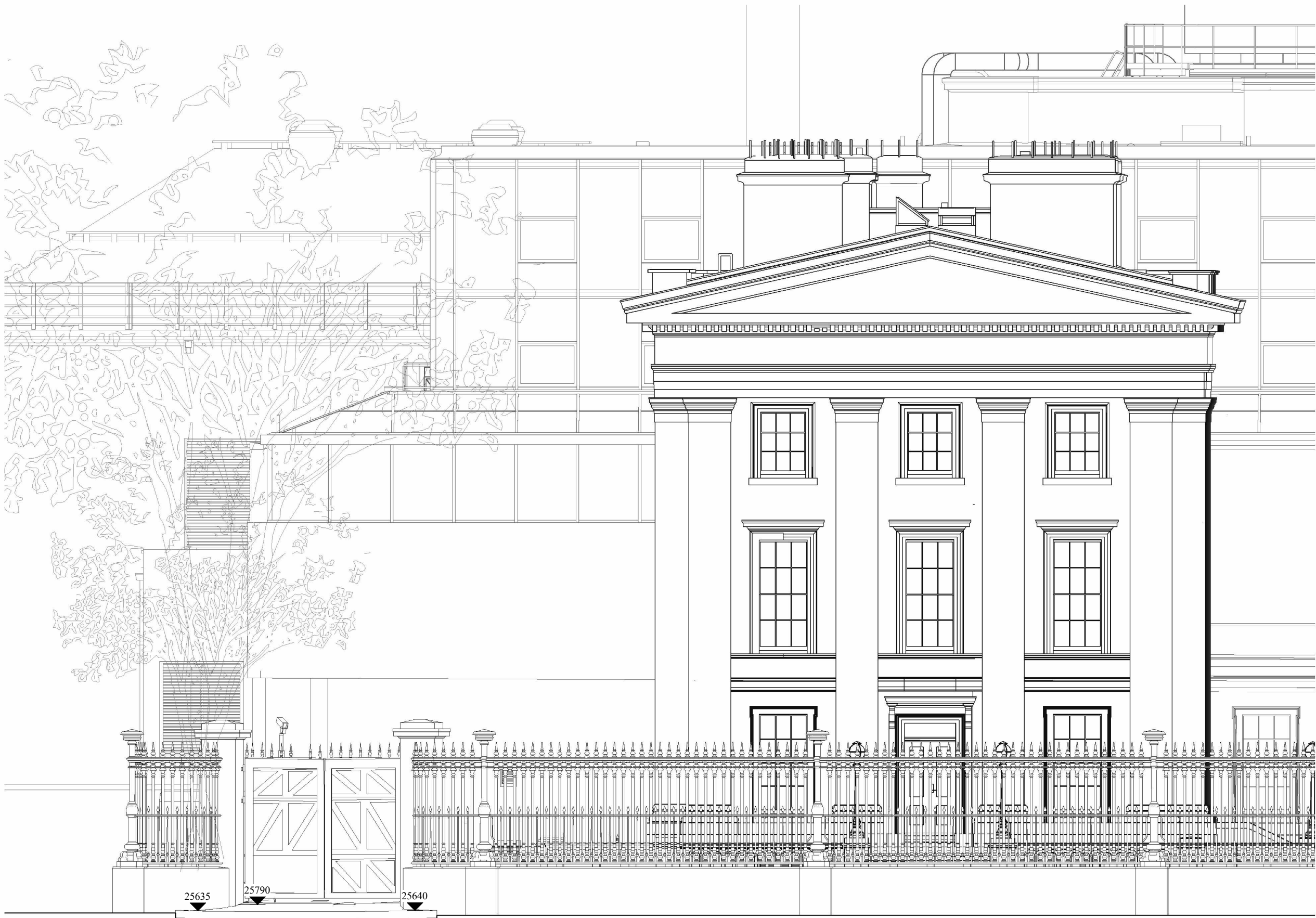
1 Enabling Works South West Gate Elevation - Existing 1 : 100