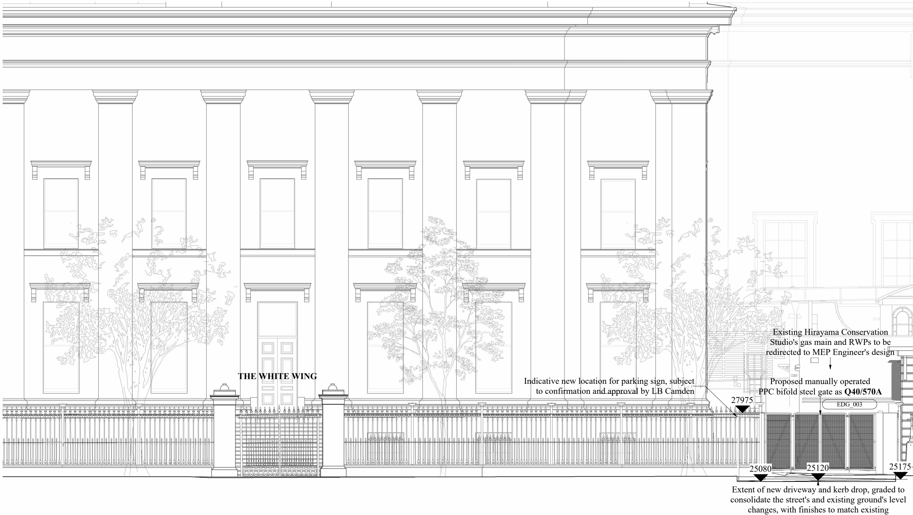
3 Enabling Works South East Gate Elevation - Proposed 1 : 100

89-91 Bayham Street London NW1 0AG T +44(0)20 7428 9393 E www.wrightandwright.co.uk