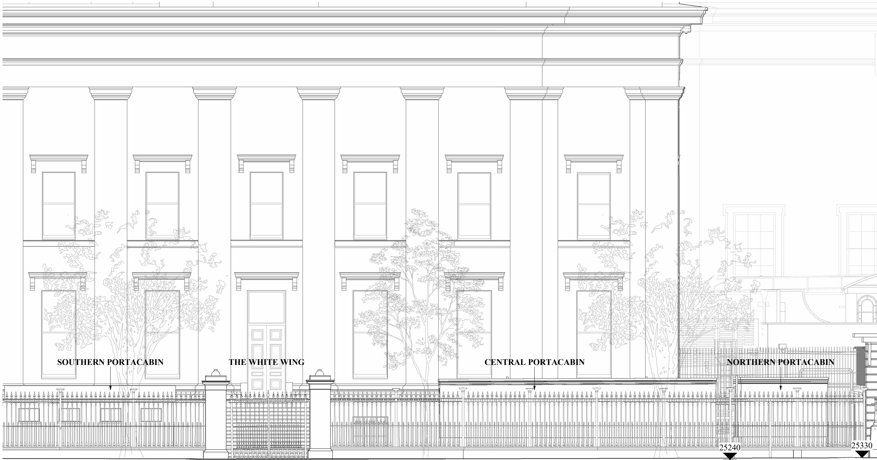
1 Enabling Works South East Gate Elevation - Existing 1 : 100