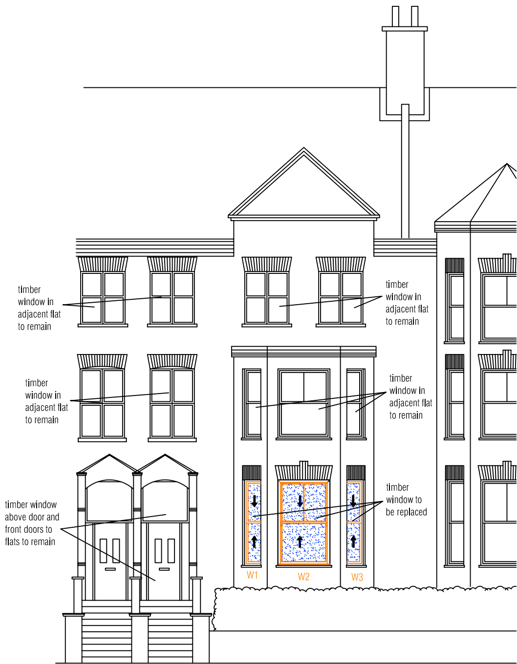
PROPOSED FRONT ELEVATION, 1:100

Studio Charrette will not be responsible for any principal designer duties under CDM 2015. No site work is to be carried out until permissions are in place. Site searches to carried out before any works to site. All structural elemental/associated calculations to be confirmed and provided by structural engineer.