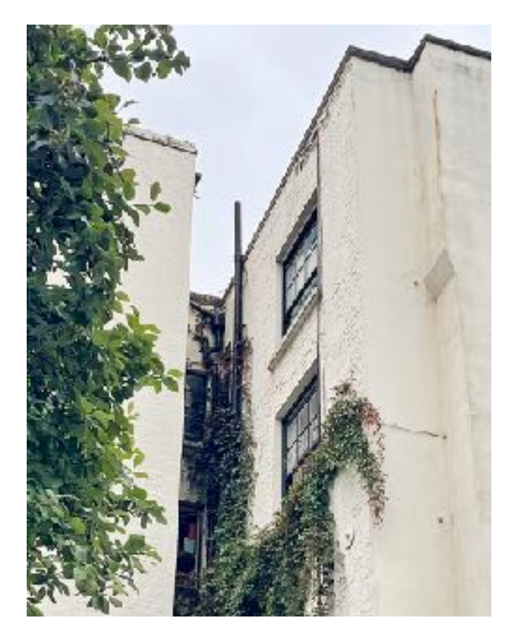
Rear Elevations Bathroom vent Location