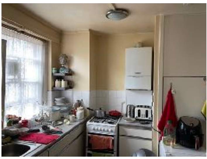
Kitchen Window vent location on second floor