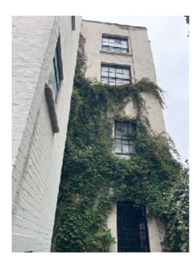
Front Elevation and Gable End