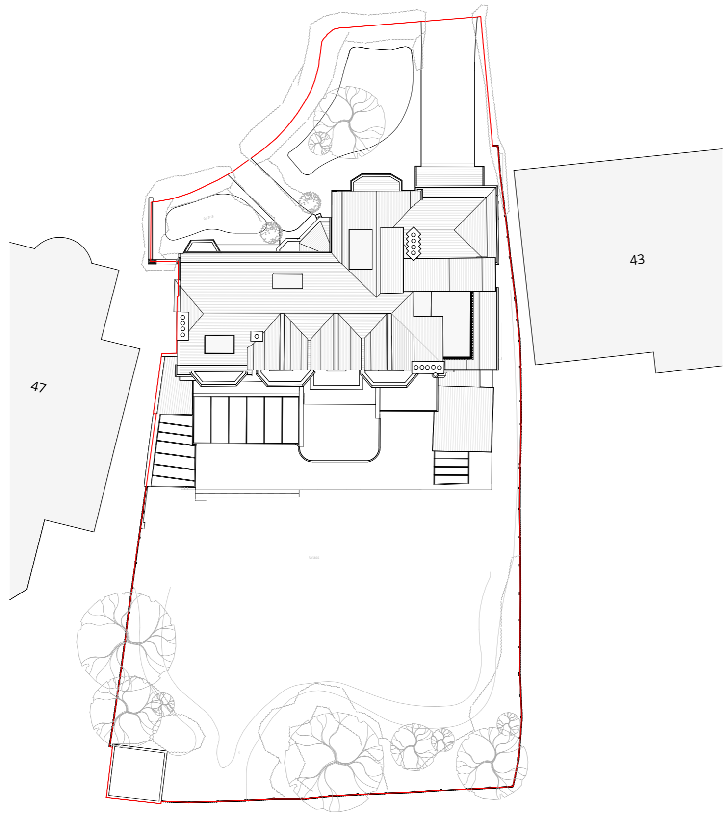
Proposed Site Plan 1 : 250