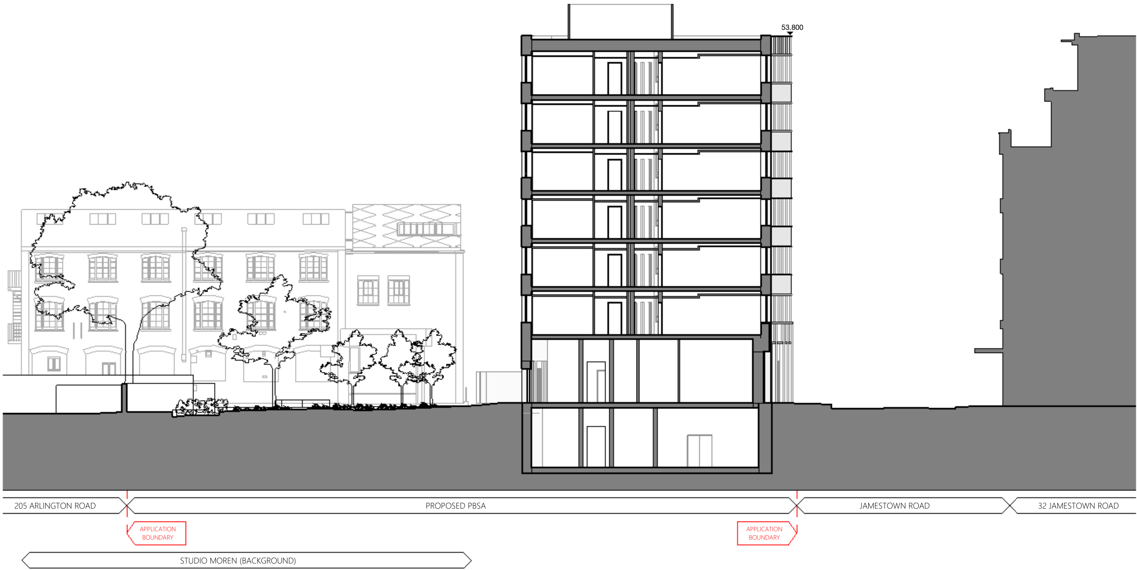
1 | PROPOSED SEC AA 06301 | 1:150

NOTES: SUPPLEMENTARY INFORMATION: These drawings reflect the current position of the scheme development at RIBA Stage 2. They should be read in conjunction with the following information prepared by Morris+Company (MCO): 33-35 Jamestown Road Design and Access Statement 23054-MCO-XX-XX-DS-A-02017 These drawings should also be read in conjunction with the following information, prepared by other consultants: - Structures Reports and Information (HDR Inc.) - MEP Reports and Information (Wallace Whittle) - Fire Report (Jensen Hughes) - Acoustic Report (RBA Acoustics) - Waste and Transport Report (scni) - Energy Report (Wallace Whittle) - Environmental and Sustainability Consultant (Wallace Whittle) - Landscape Drawings and Specification (New Practice and Context Office) EXTENTS AND BOUNDARIES: These drawings combine survey and site information produced by others and as such should be verified for accuracy. Existing site information, context, surrounding infrastructure, neighbouring building extents and plots are derived from 2D Surveys, produced by: 'Maltby Land Surveys Ltd' Survey Date: 13.02.2024 Survey Reference: 22249-100-RevA Planning Application Boundary