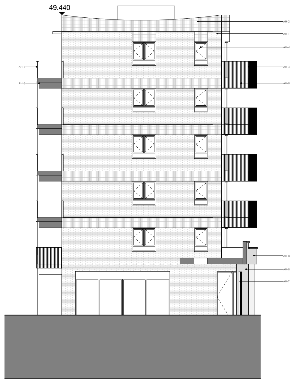
1 | PROPOSED ELE C3 GABLE EAST