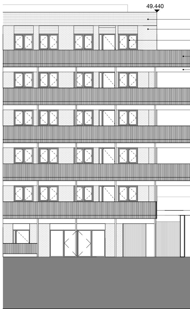
2 | PROPOSED ELE C3 COURTYARD SOUTH