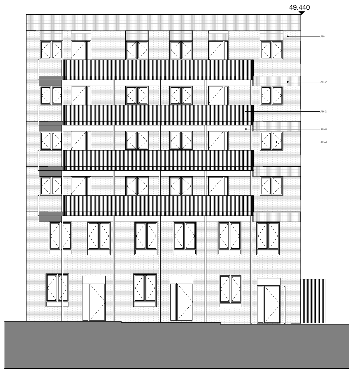
3 | PROPOSED ELE C3 COURTYARD WEST