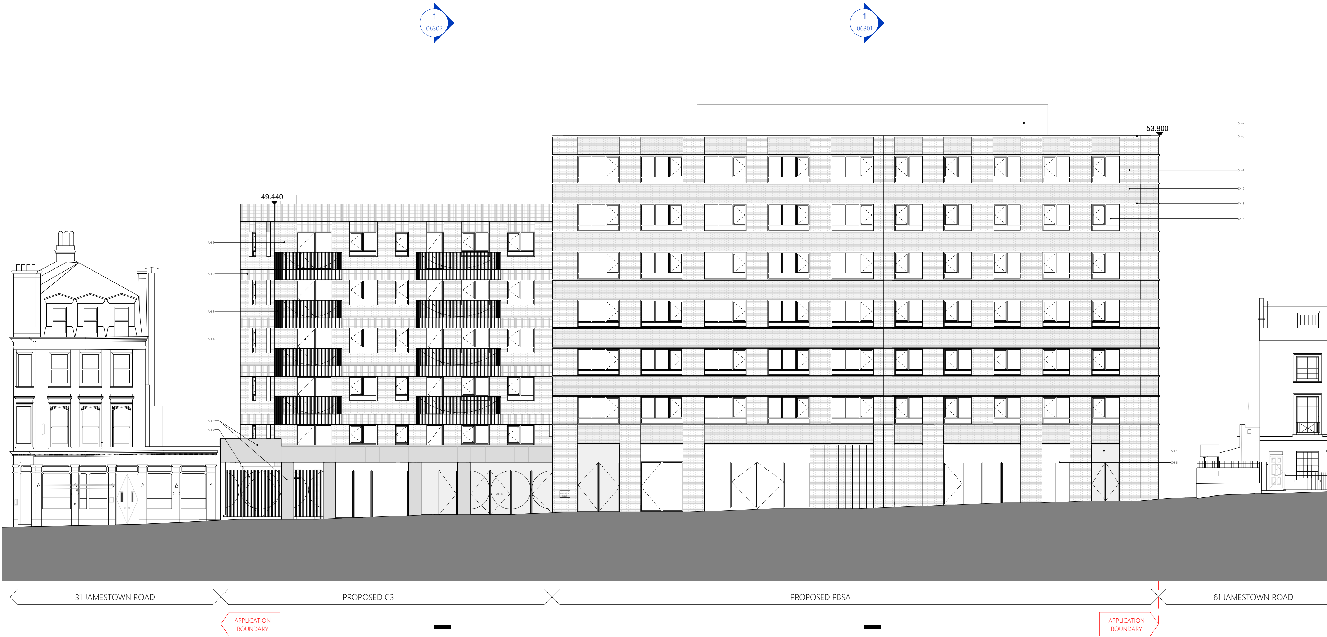
1 | PROPOSED ELE NORTH 06201 | 1:150

NOTES: SUPPLEMENTARY INFORMATION: These drawings reflect the current position of the scheme development at RIBA Stage 2. They should be read in conjunction with the following information prepared by Morris+Company (MCO): 33-35 Jamestown Road Design and Access Statement 23054-MCO-XX-XX-DS-A-02017 These drawings should also be read in conjunction with the following information, prepared by other consultants: - Structures Reports and Information (SDR Inc.) - MEP Reports and Information (Wallace Whittle) - Fire Report (Jensen Hughes) - Acoustic Report (RBA Acoustics) - Waste and Transport Report (iceni) - Energy Report (Wallace Whittle) - Environmental and Sustainability Consultant (Wallace Whittle) - Landscape Drawings and Specification (New Practice and Context Office) EXTENTS AND BOUNDARIES: These drawings combine survey and site information produced by others and as such should be verified for accuracy. Existing site information, context, surrounding infrastructure, neighbouring building extents and plots are derived from 2D Surveys, produced by: 'Maltby Land Surveys Ltd' Survey Date: 13.02.2024 Survey Reference: 22249-100-RevA Planning Application Boundary