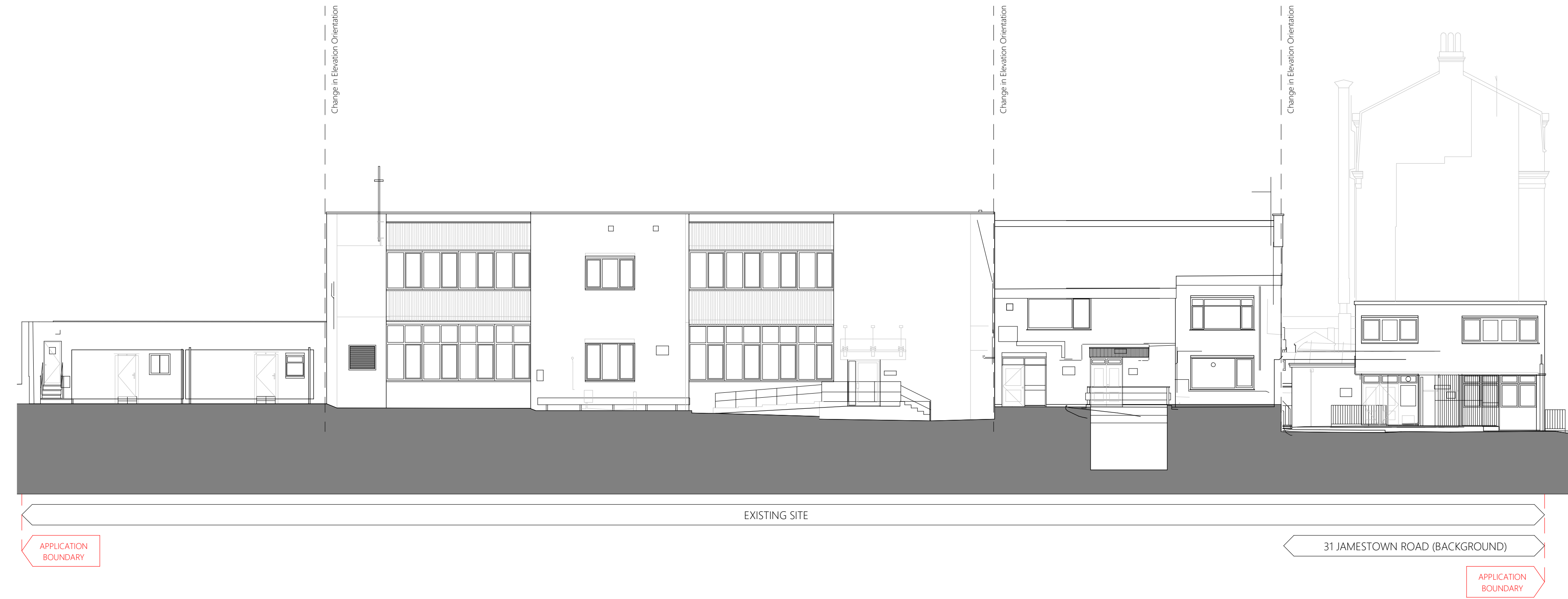
1 | EXISTING ELE SOUTH 05202 | 1 : 150