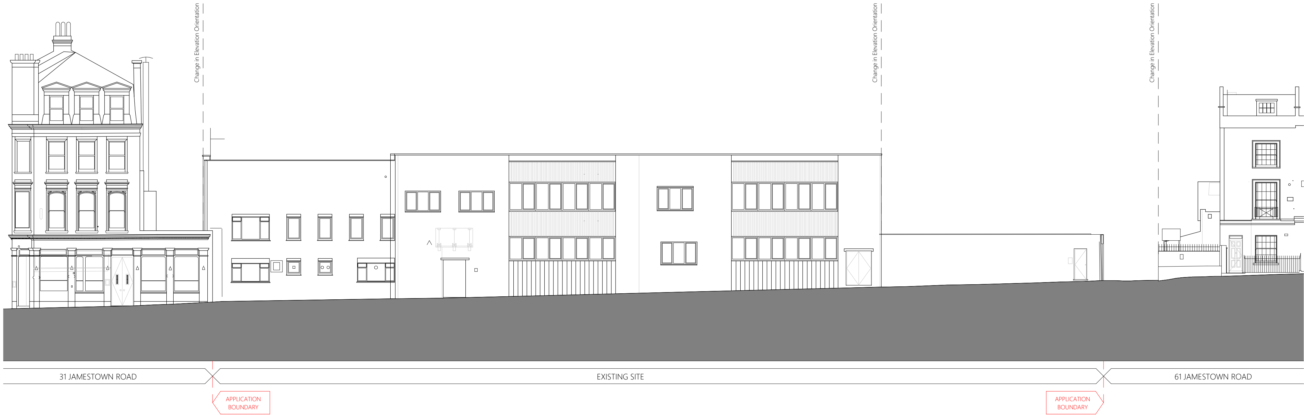
1 | EXISITNG ELE NORTH 05201 | 1:150