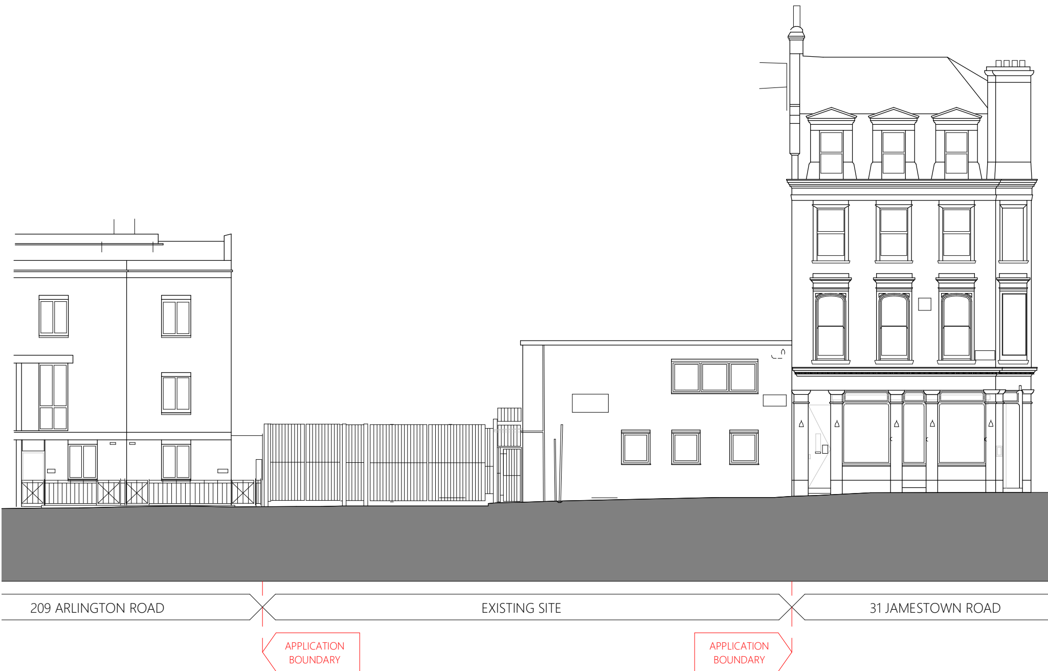
2 | EXISTING ELE EAST 05201 | 1:150

NOTES: SUPPLEMENTARY INFORMATION: These drawings reflect the current position of the scheme development at RIBA Stage 2. They should be read in conjunction with the following information prepared by Morris+Company (MCO): 33-35 Jamestown Road Design and Access Statement 23054-MCO-XX-XX-DS-A-02017 These drawings should also be read in conjunction with the following information, prepared by other consultants: - Structures Reports and Information (HDR Inc.) - MEP Reports and Information (Wallace Whittle) - Fire Report (Jensen Hughes) - Acoustic Report (RBA Acoustics) - Waste and Transport Report (iceni) - Energy Report (Wallace Whittle) - Environmental and Sustainability Consultant (Wallace Whittle) - Landscape Drawings and Specification (New Practice and Context Office) EXTENTS AND BOUNDARIES: These drawings combine survey and site information produced by others and as such should be verified for accuracy. Existing site information, context, surrounding infrastructure, neighbouring building extents and plots are derived from 2D Surveys, produced by: 'Maltby Land Surveys Ltd' Survey Date: 13.02.2024 Survey Reference: 22249-100-RevA Planning Application Boundary