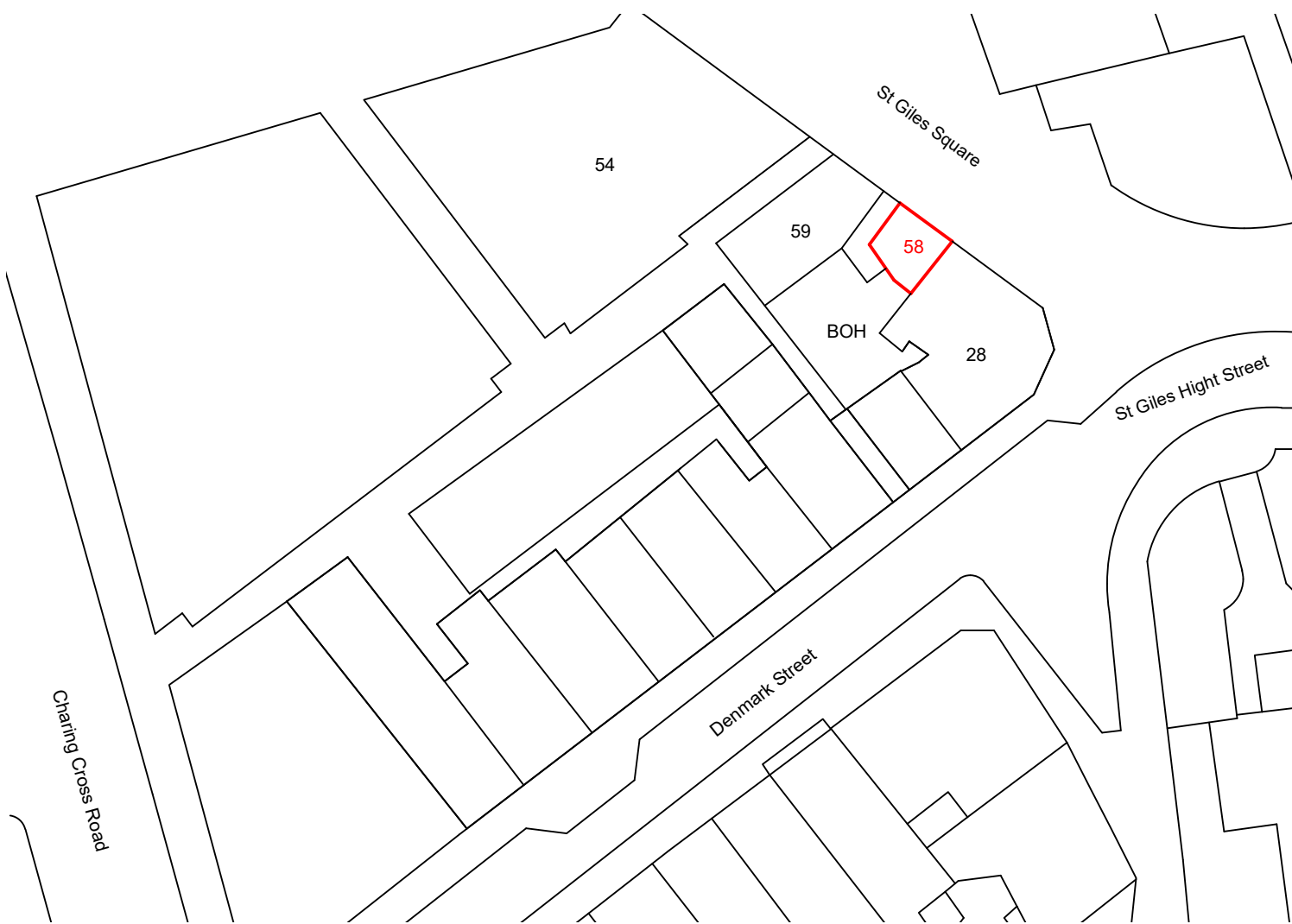
1 Location Plan 1:500@A1