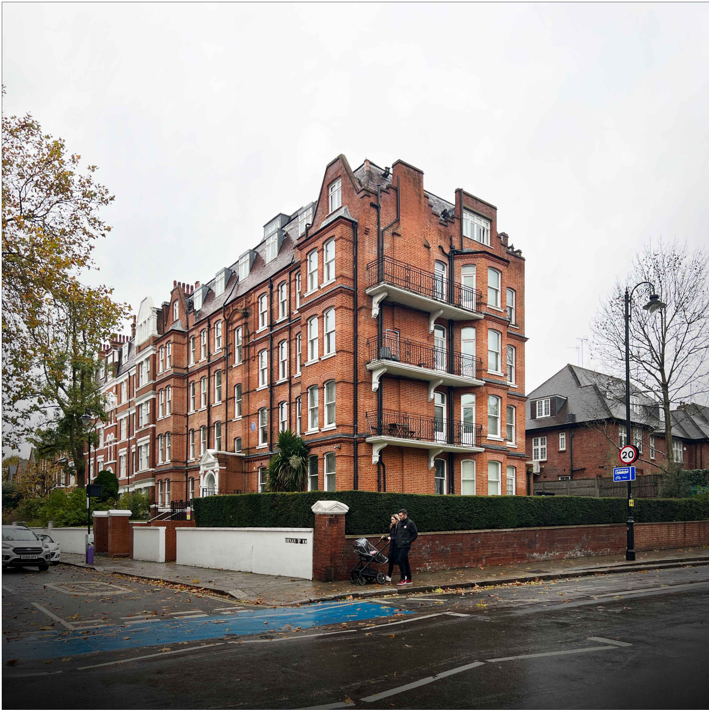
01 Existing View NTS