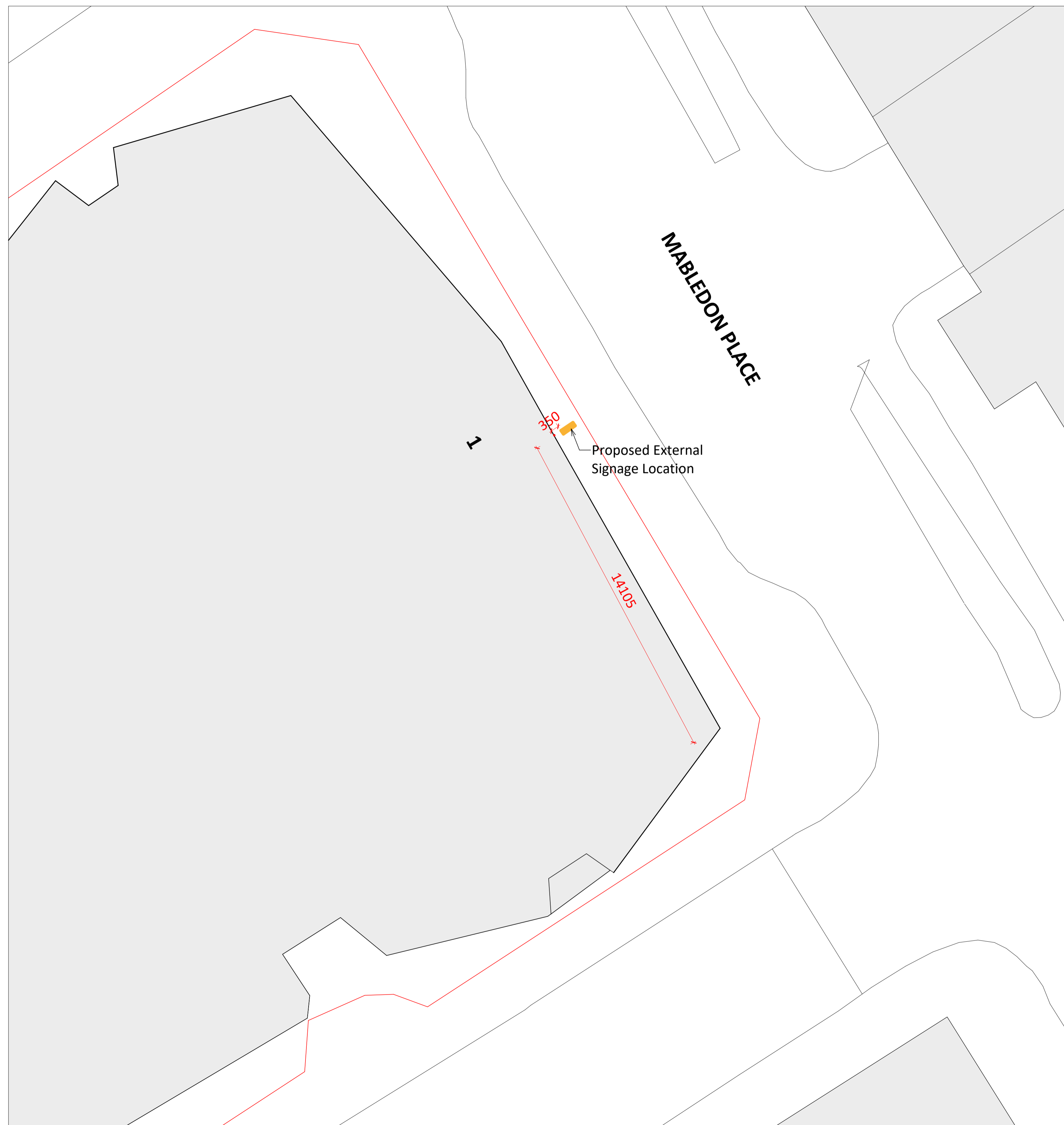
Site Plan Scale 1 : 100