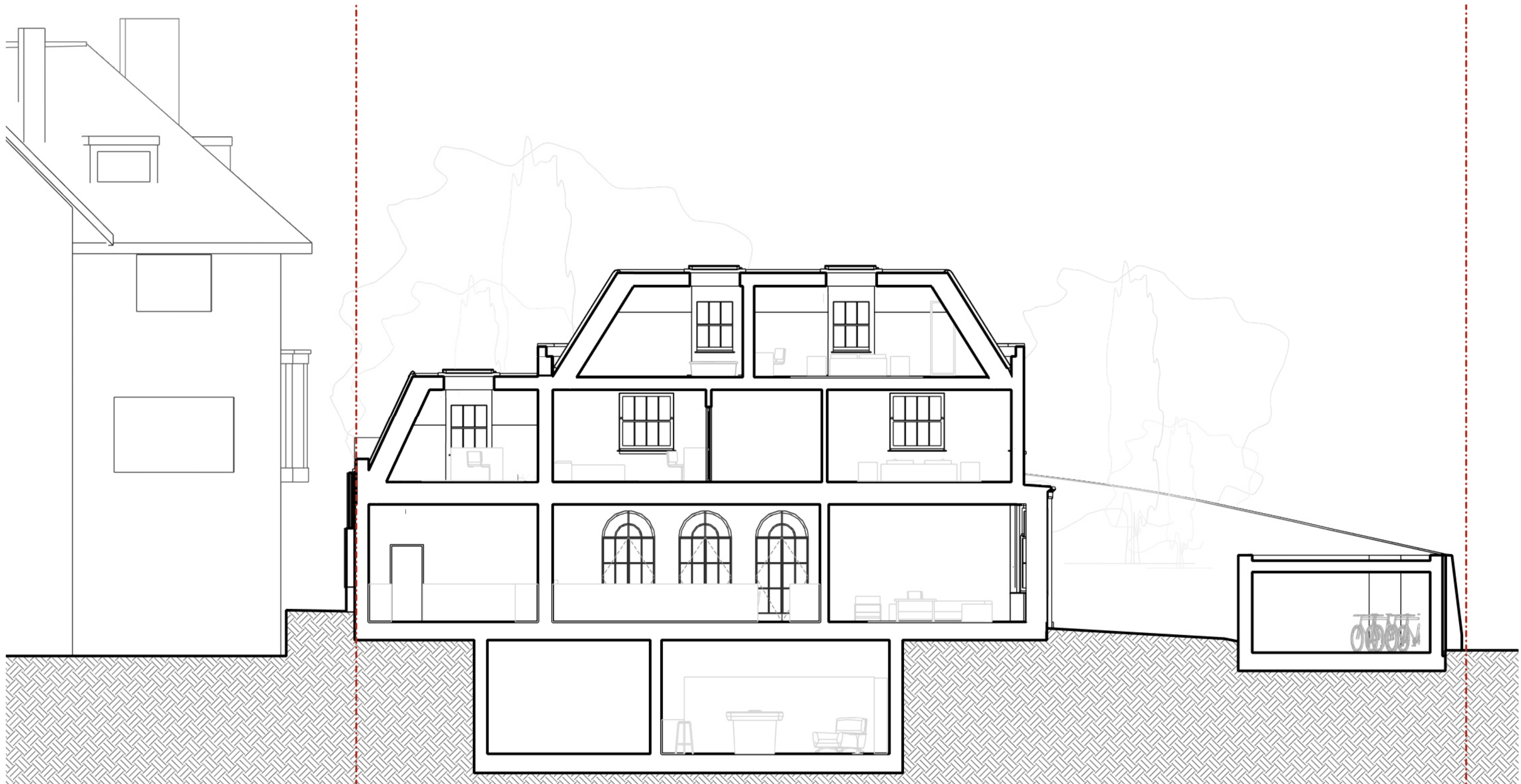
1 Proposed Section 2 1 : 50