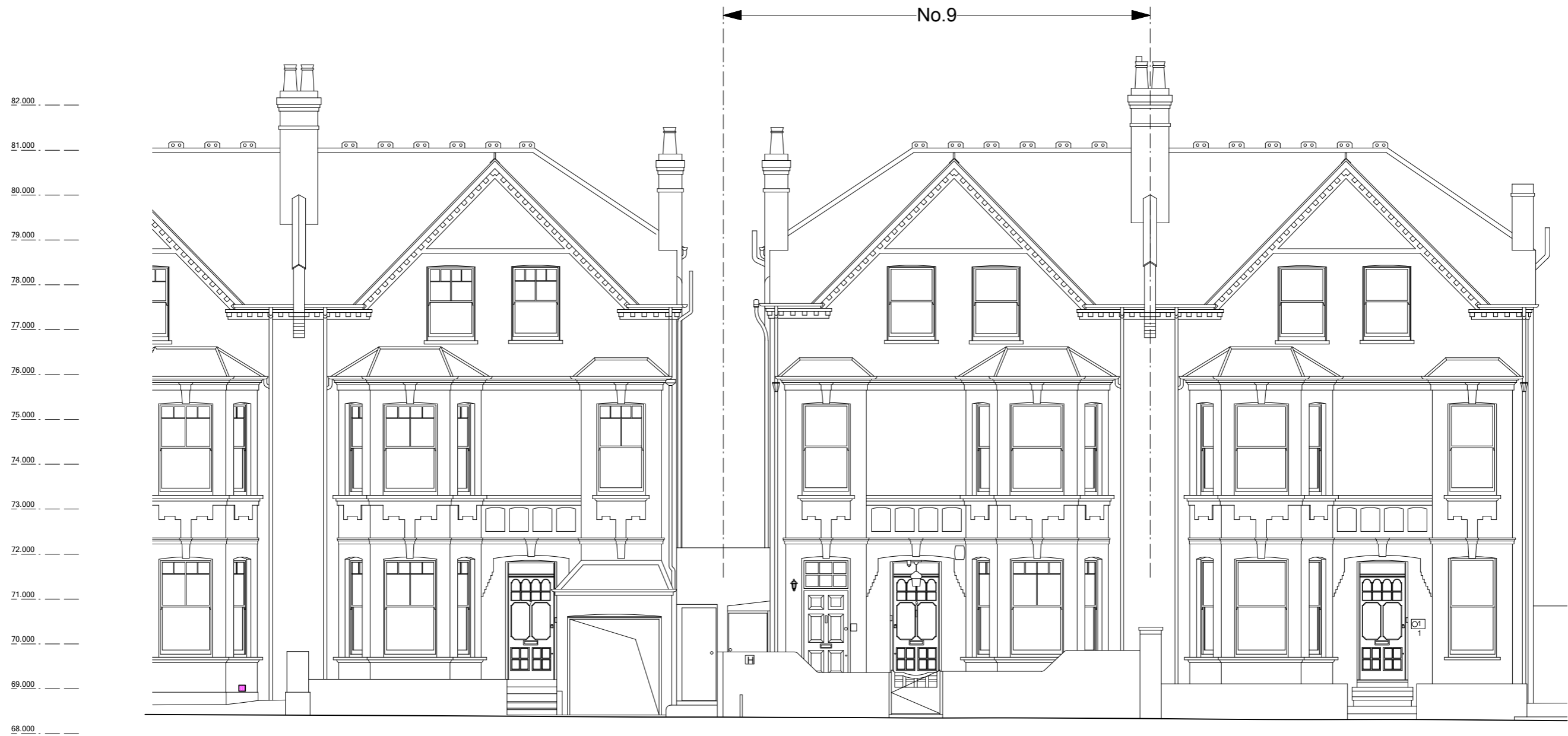
EXISTING FRONT ELEVATION (street view)