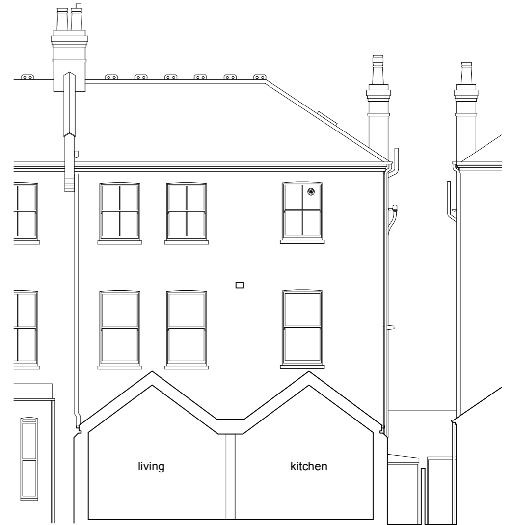
EXISTING SECTION B-B