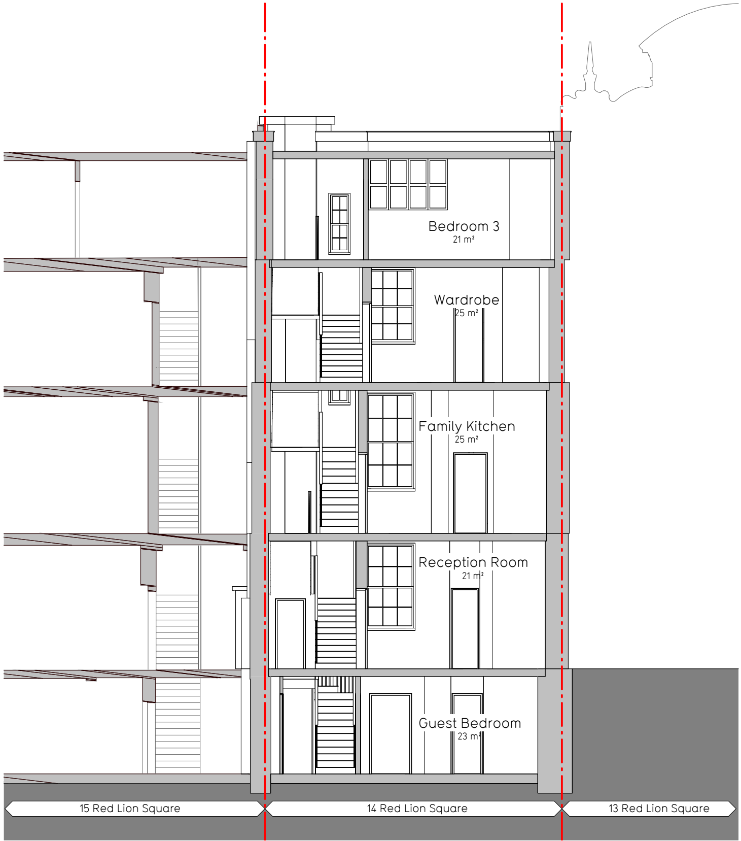
B Proposed - Section BB 201 1:100