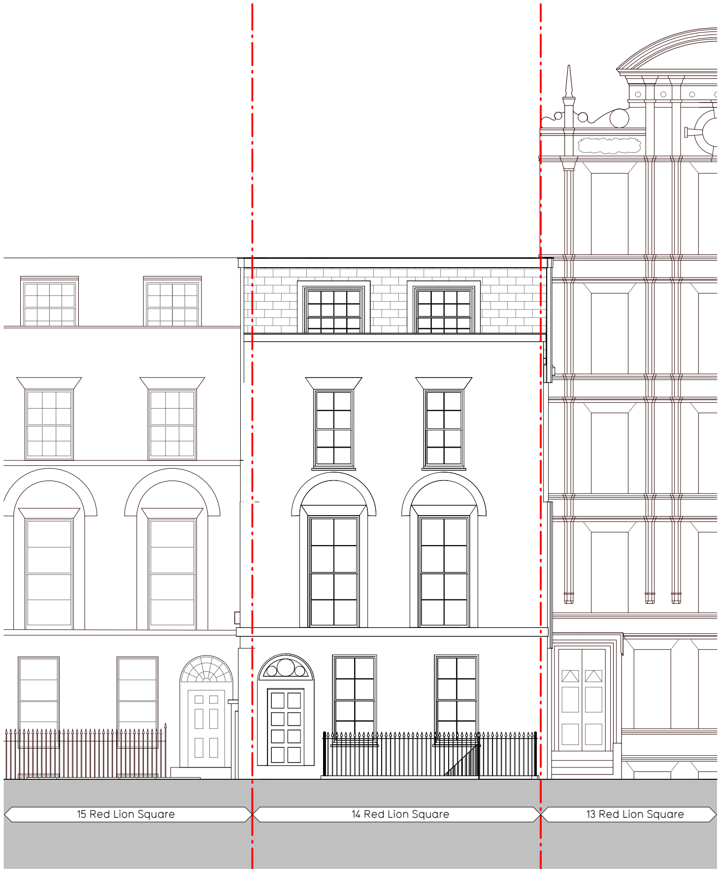
1 Existing - Red Lion Square Elevation 030 1 : 100