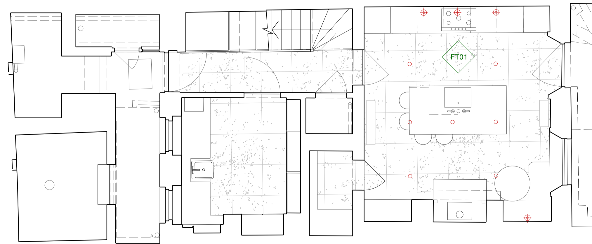
LOWER GROUND FLOOR PLAN NTS