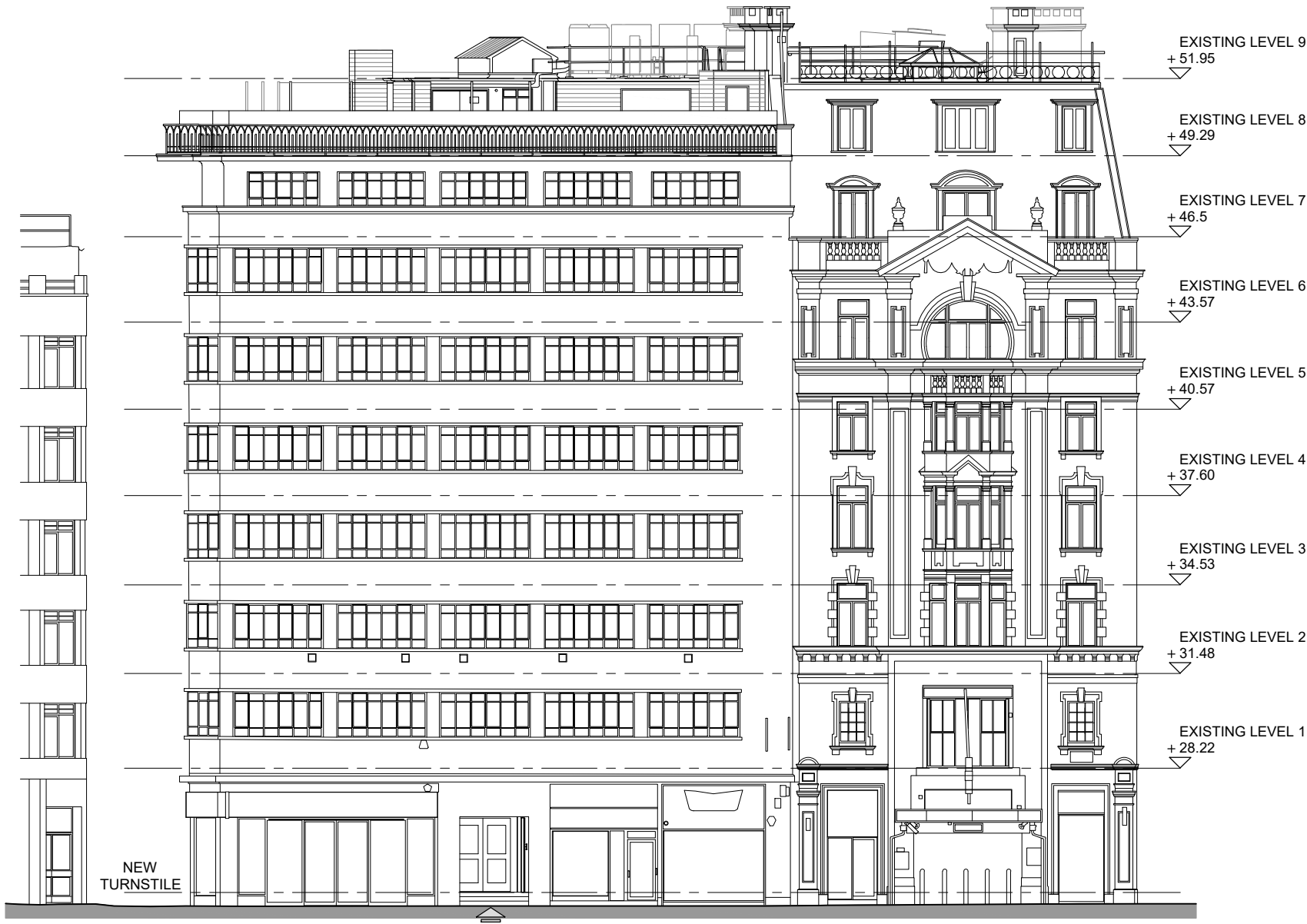
ELEVATION 3 (NORTH)