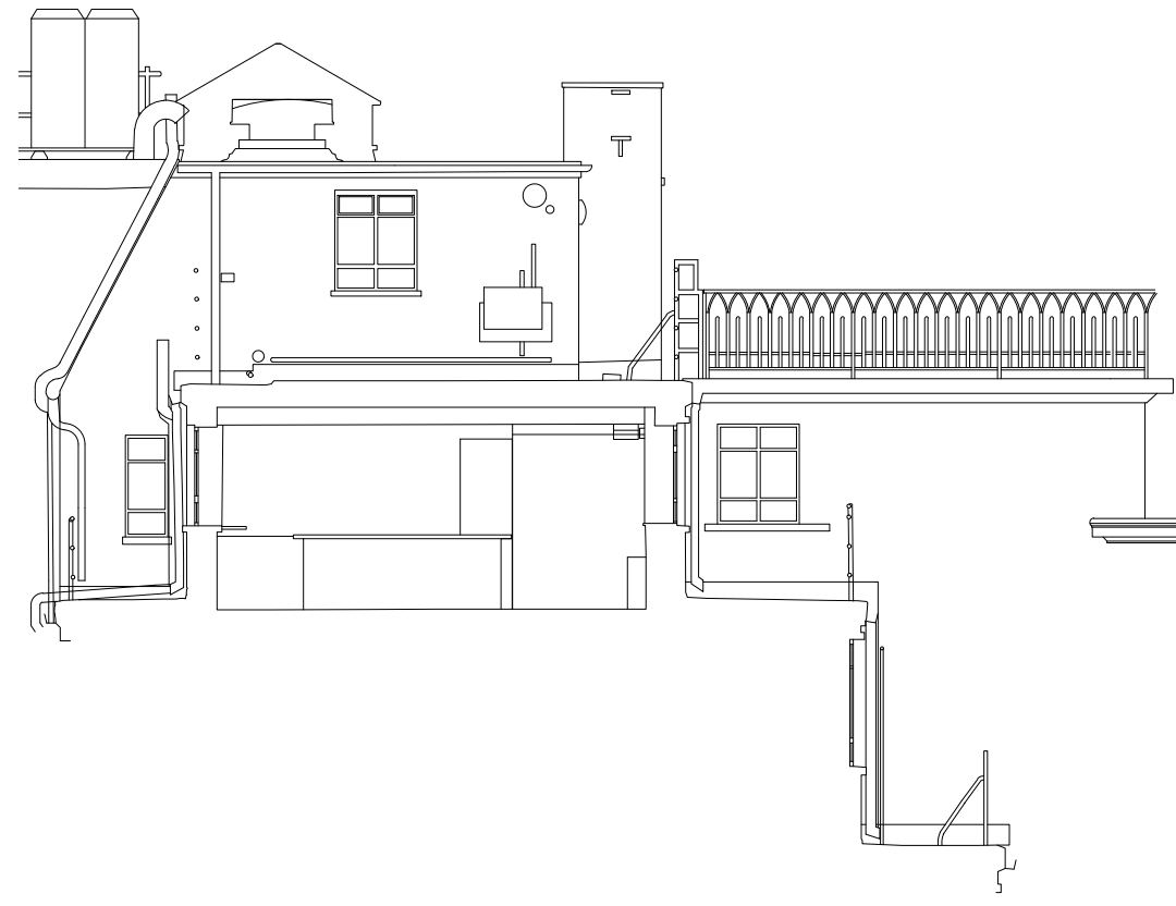
SECTIONAL ELEVATION 4