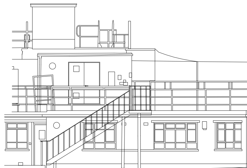
SECTIONAL ELEVATION 3