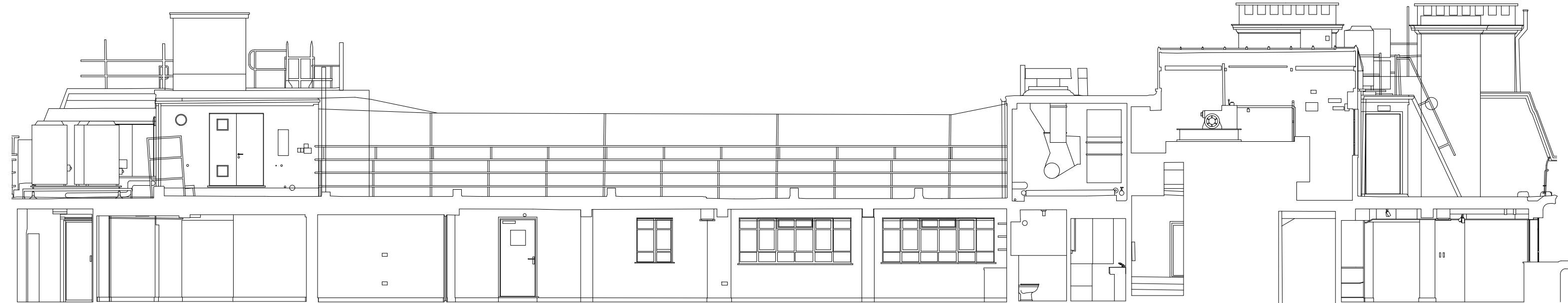
SECTIONAL ELEVATION 2