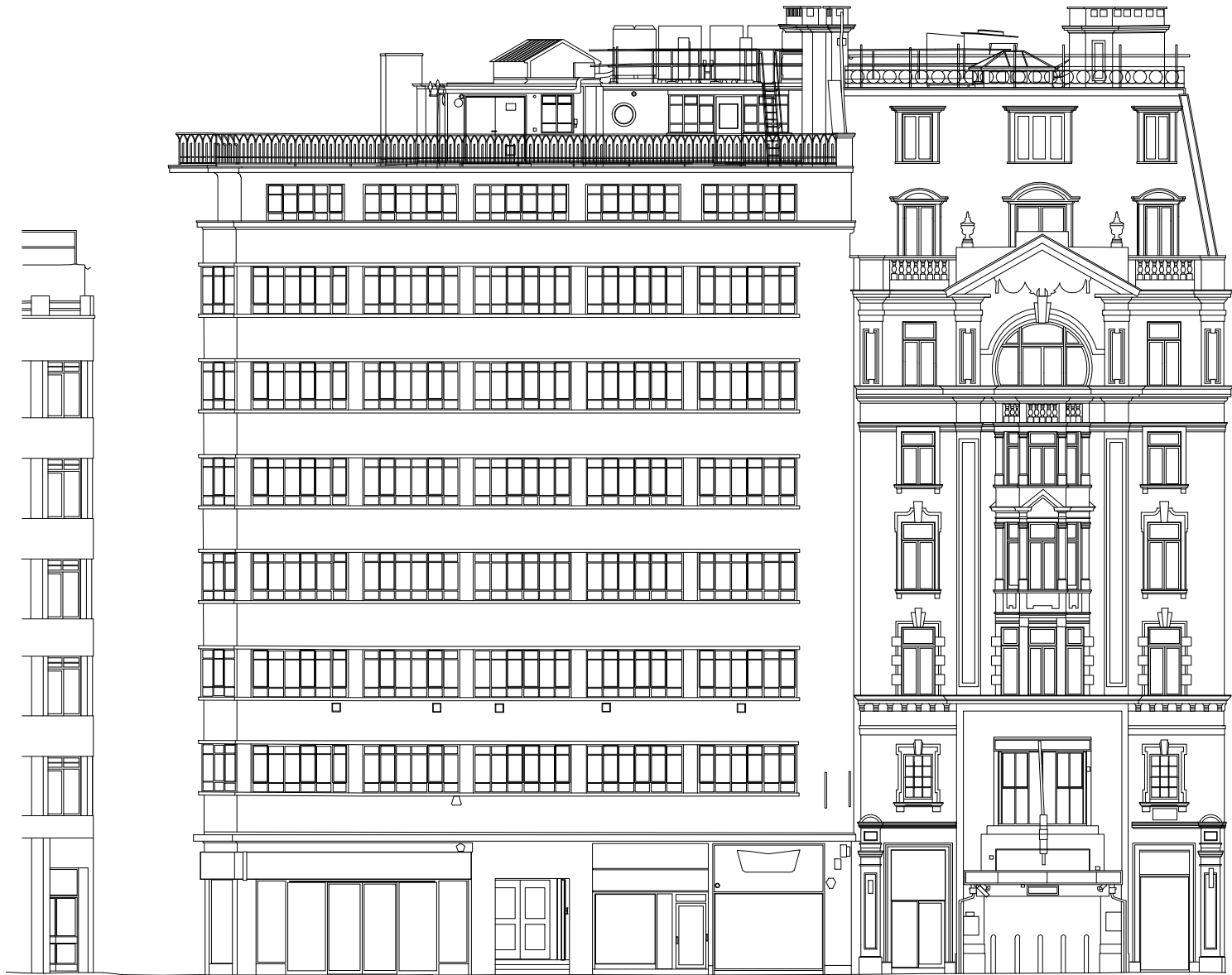
ELEVATION 3 (NORTH)

© Mountford Pigott LLP 2024 Reproduction in whole or in part by any means is prohibited without the prior permission of Mountford Pigott LLP.