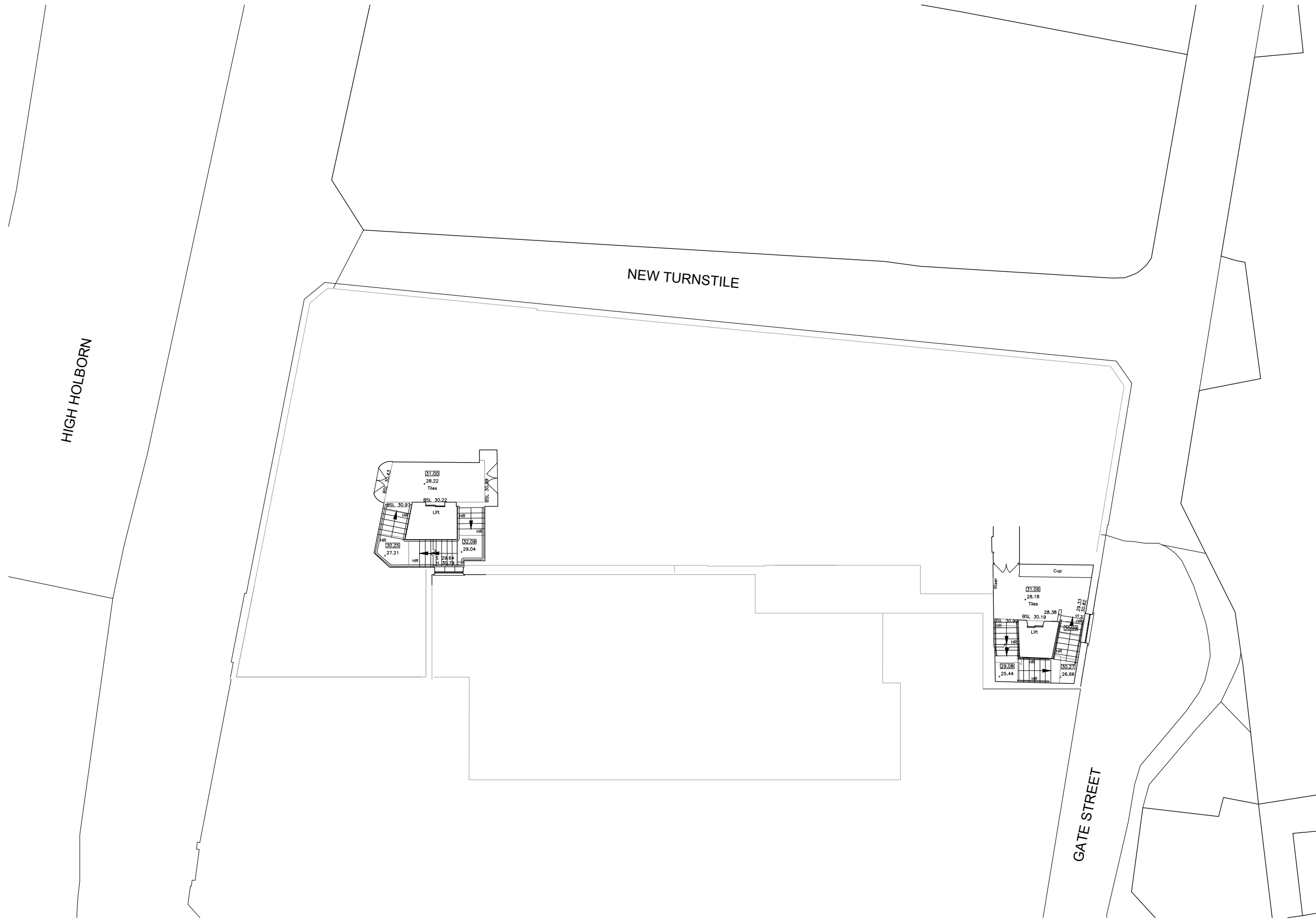
LEVEL 1 - FIRST FLOOR PLAN

© Mountford Pigott LLP 2024. Reproduction in whole or in part by any means is prohibited without the prior permission of Mountford Pigott LLP.