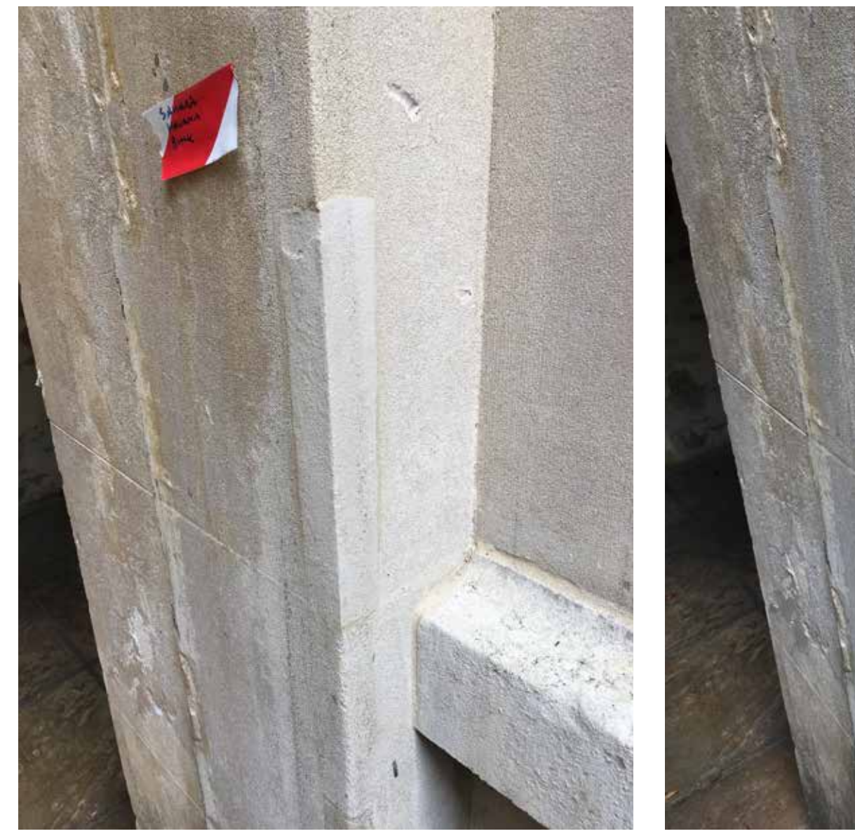
The corner repair after ten days. This repair is considered satisfactory.

D.4.2 After seven and a half months there is no perceptable change to the repairs located on the corner of the basement pier.