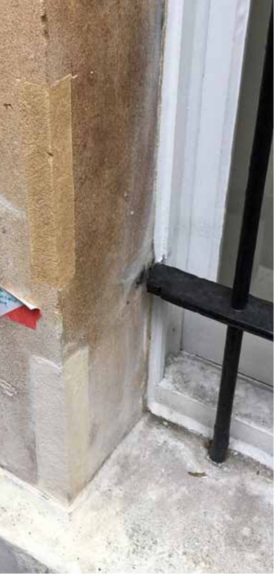
Photo of tinting repair taken on October 23rd, 2024. The repair identification label is still in place.

D.5.1 An successful repair to the corner of a pier in the basement area of