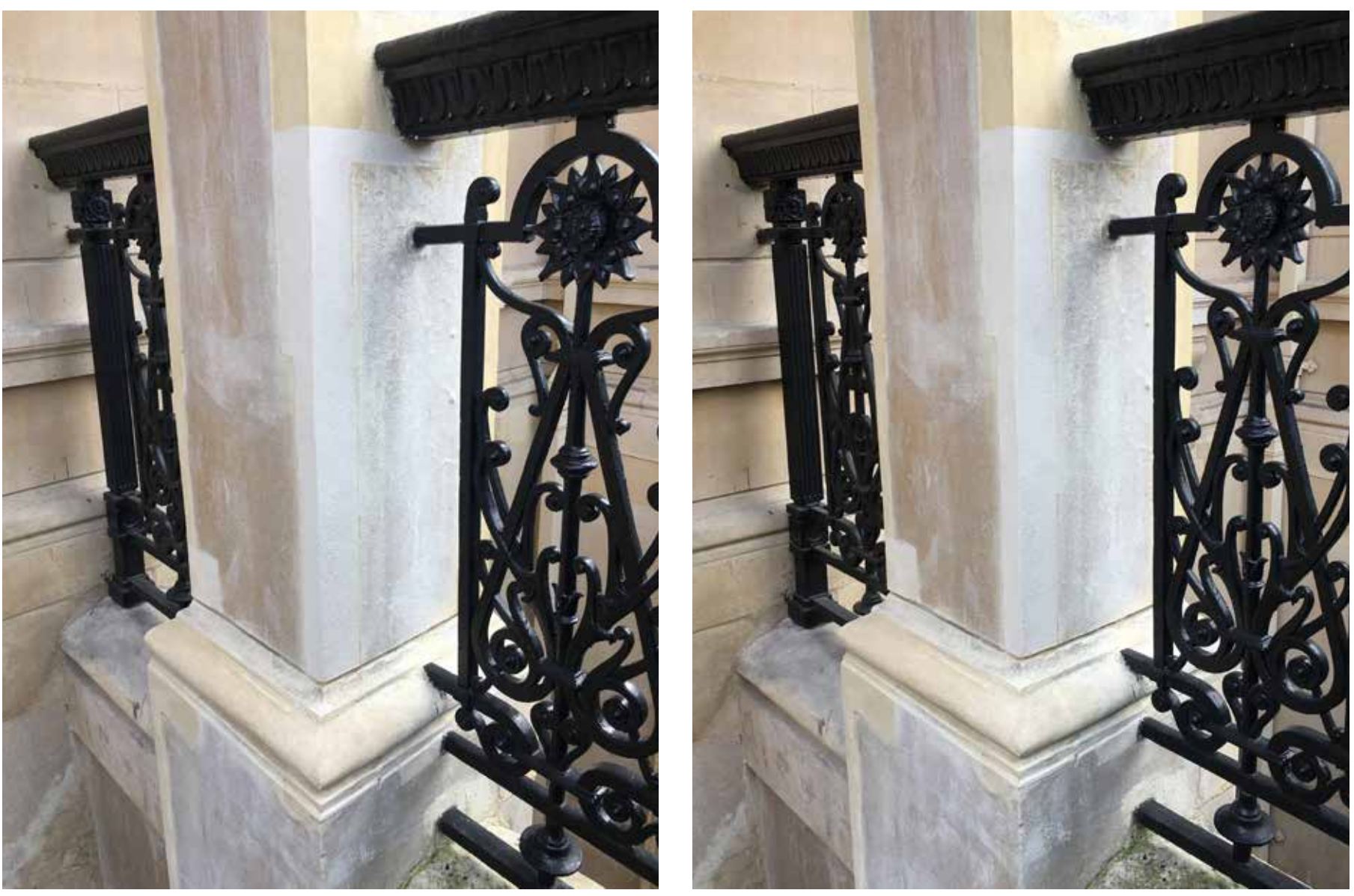
The corner repair after ten days on March 16. The side facing outwards is considered satisfactory, while the lateral face still has a strong contrast to the darker adjacent stone.

D.3.2 After seven and a half months there is no perceptable change to the repairs located to the lower corner of the pier.