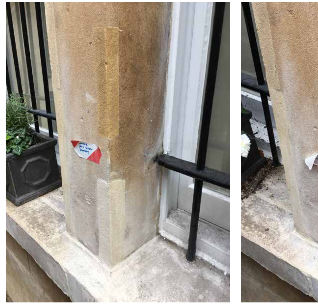
The corner repair after ten days. The repair is considered satisfactory.

D.5.2 After seven and a half months there is no perceptable change to the repairs located on the corner of the basement window pier.