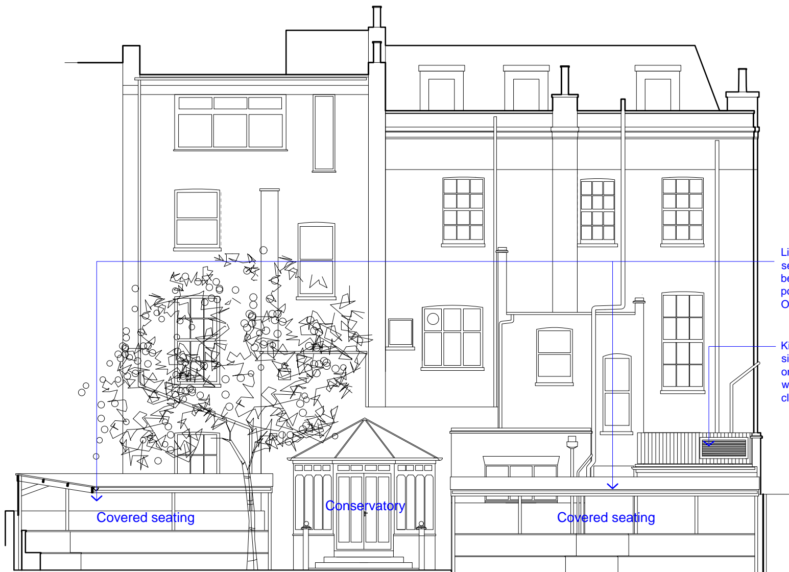
Rear Elevation A-A from Pub Garden - see drg 1743/01

Lightweight timber framed external seating with loose tables and benches covered with clear polycarbonate corrugated roofing. Overall height 2.4m max.