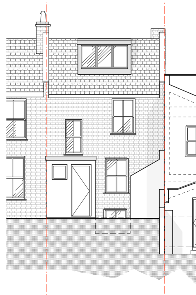
2. PROPOSED REAR ELEVATION (UNCHANGED)