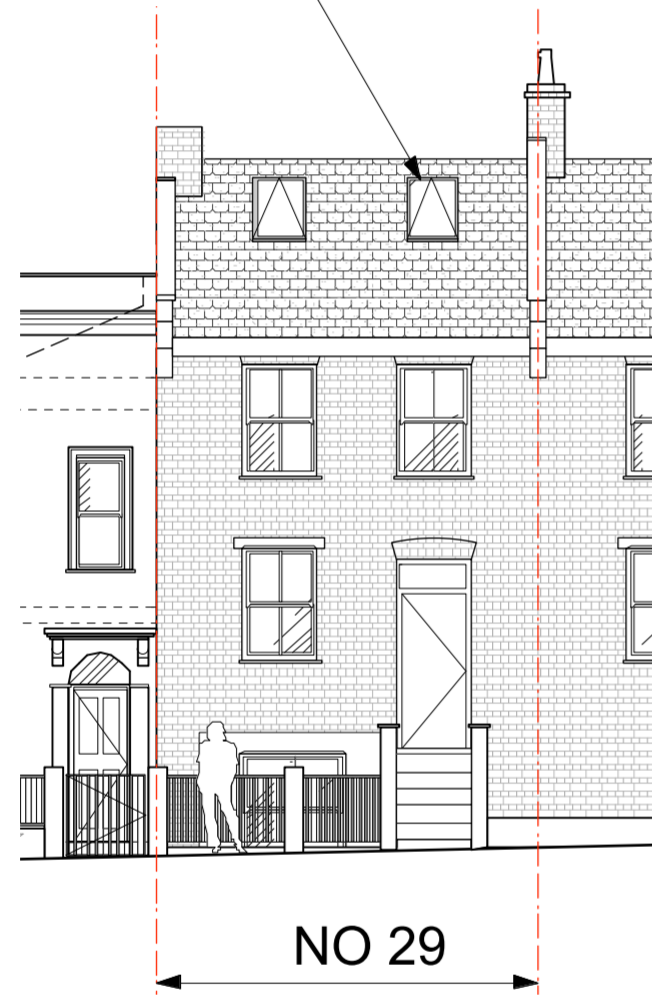
1. PROPOSED FRONT ELEVATION

2 x low profile (conservation style) velux windows