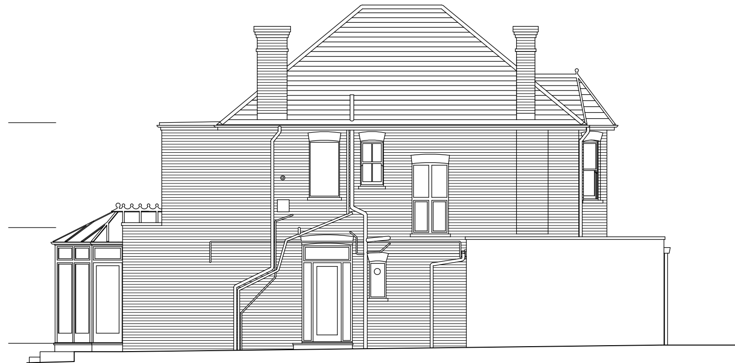
SIDE EAST ELEVATION