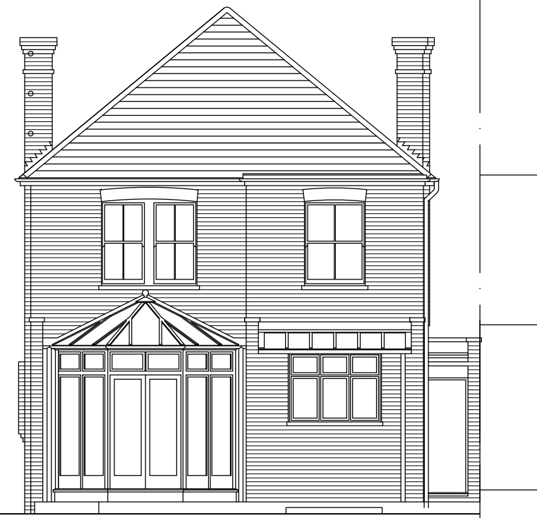
REAR SOUTH ELEVATION