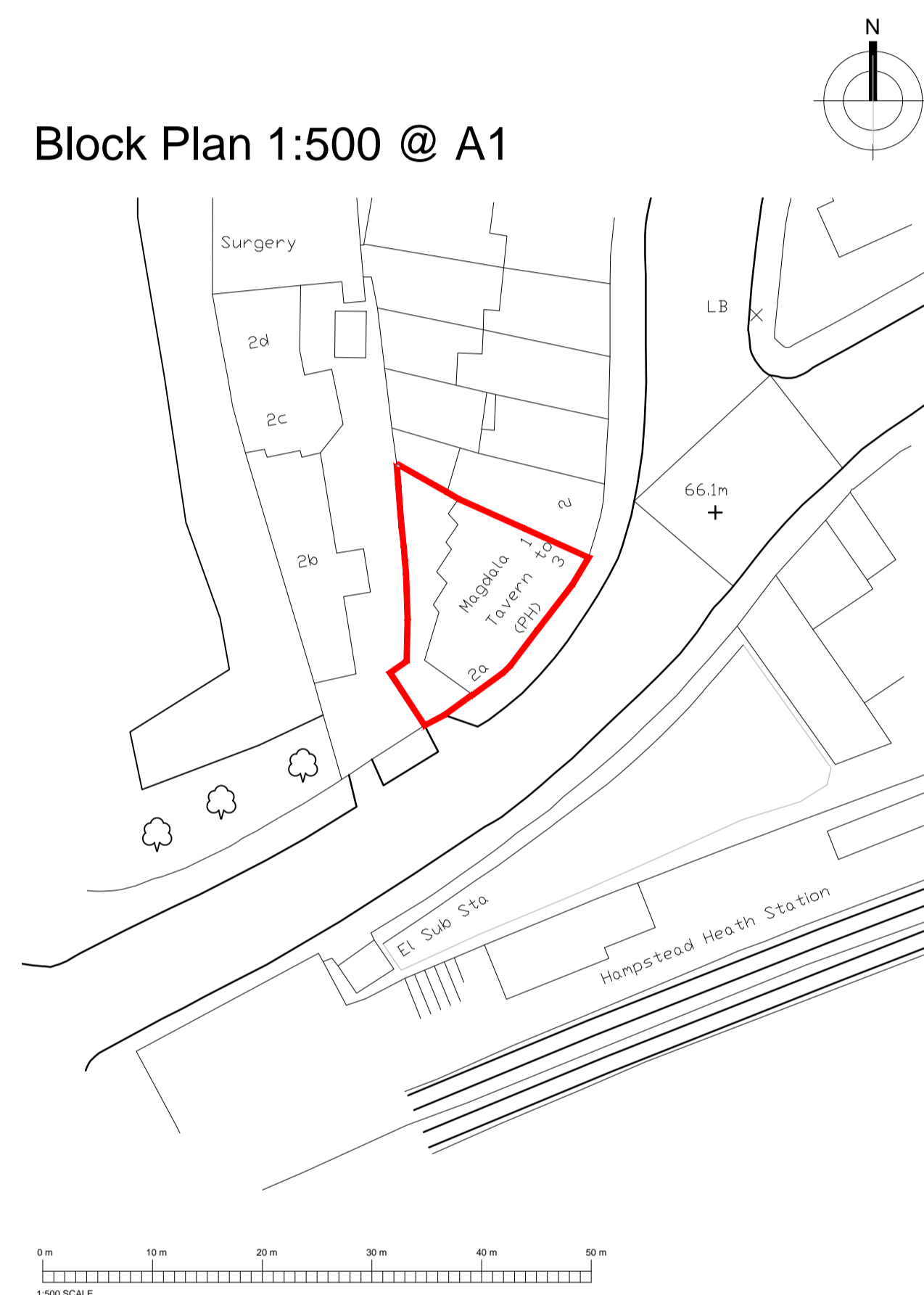
Block Plan 1:500 @ A1