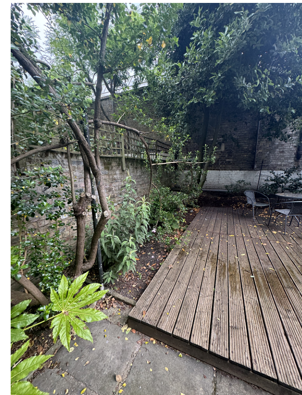
E - Existing Rear Patio