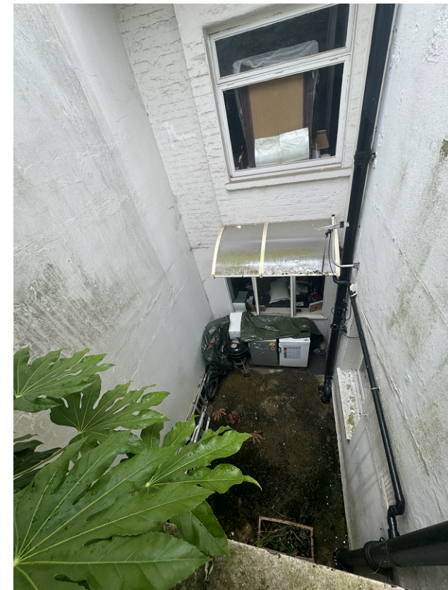
C - Existing View to rear lightwell