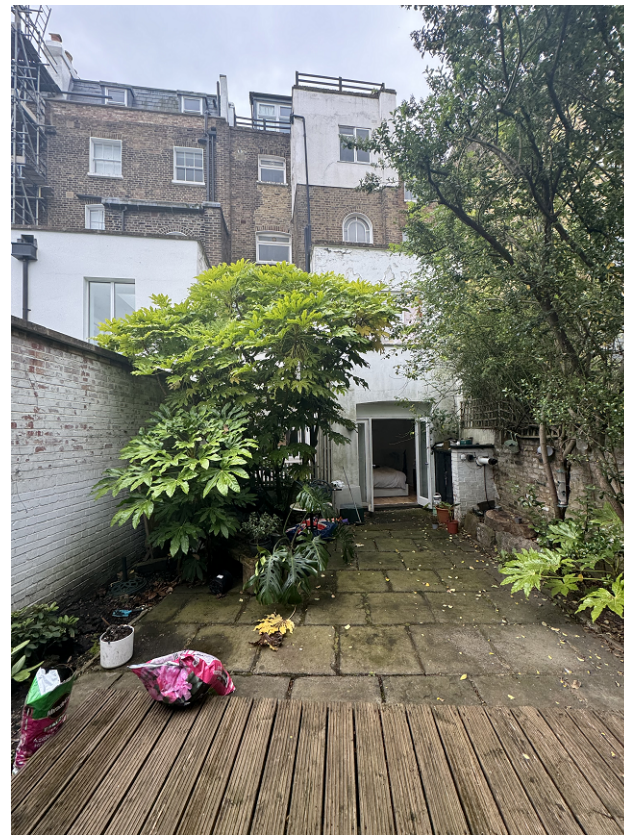
B - Existing Rear Elevation