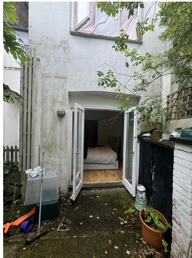
D - Existing Rear Garden access door