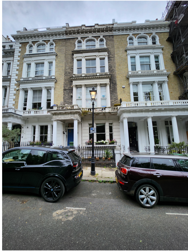
A - Existing Front Elevation from Street View