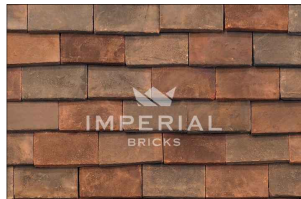
Imperial Bricks - Coalport Handcrafted Clay Roof Tiles