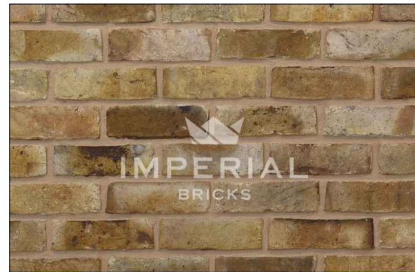
Imperial Bricks - Light Weathered Original London Stock