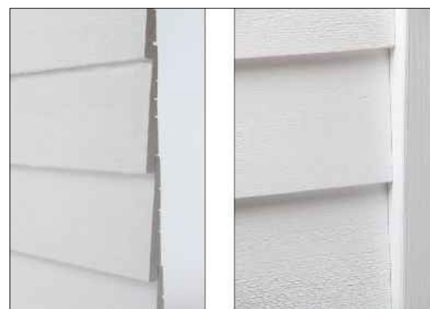
Chiltern Timber - Pre-painted White Weatherboard Cladding 3.9m