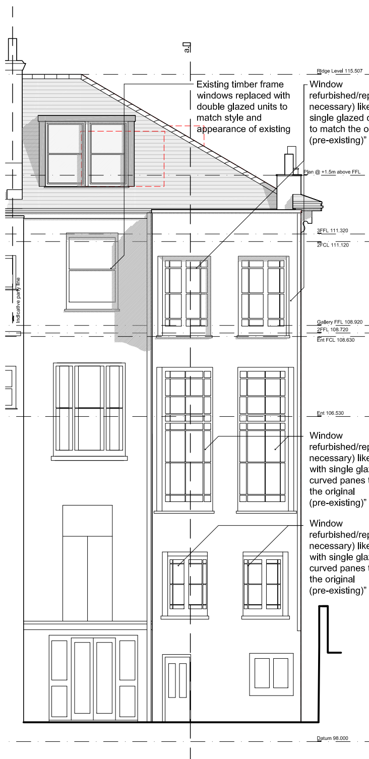
PROPOSED REAR ELEVATION SCALE: 1:100@A3 0.0 1.0 2.0 3.0 4.0 5.0