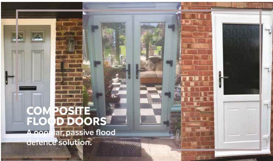
COMPOSITE FLOOD DOORS A popular, passive flood defence solution.

Composite flood doors are suitable for single doors only. With a wide range of styles and finishes, the doors offer flood protection whilst maintaining the existing aesthetics of your property.