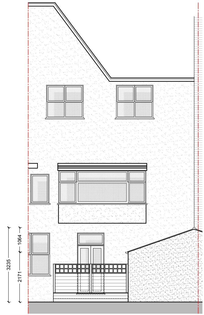
Rear Elevation As Existing - Scale 1:100