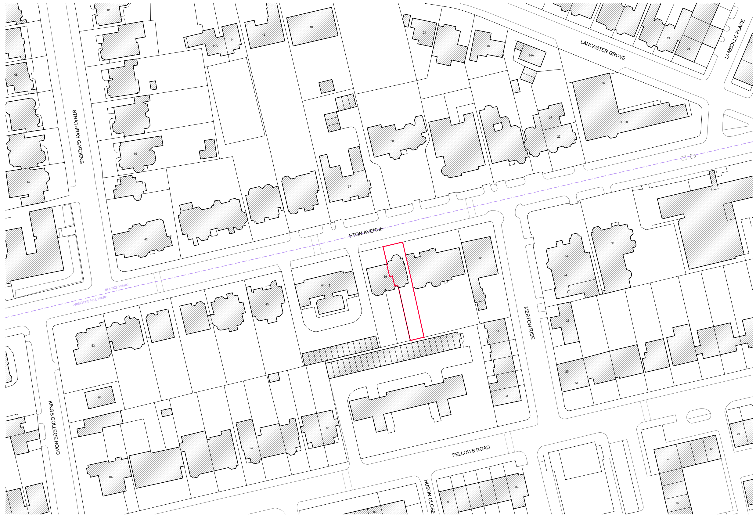
SITE LOCATION PLAN 1:1000 / A3