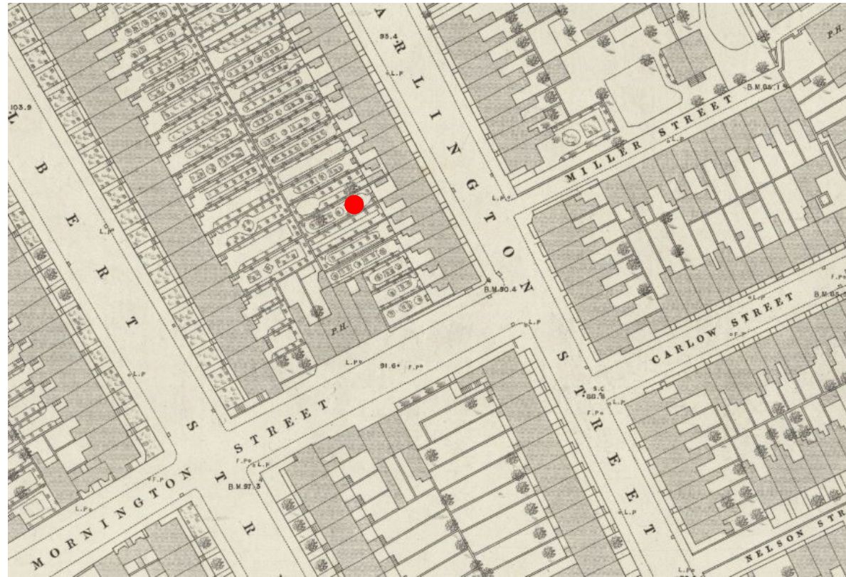
1.1: 1870 OS map showing Arlington Street, now Arlington Road. No.45 is identified by the red dot