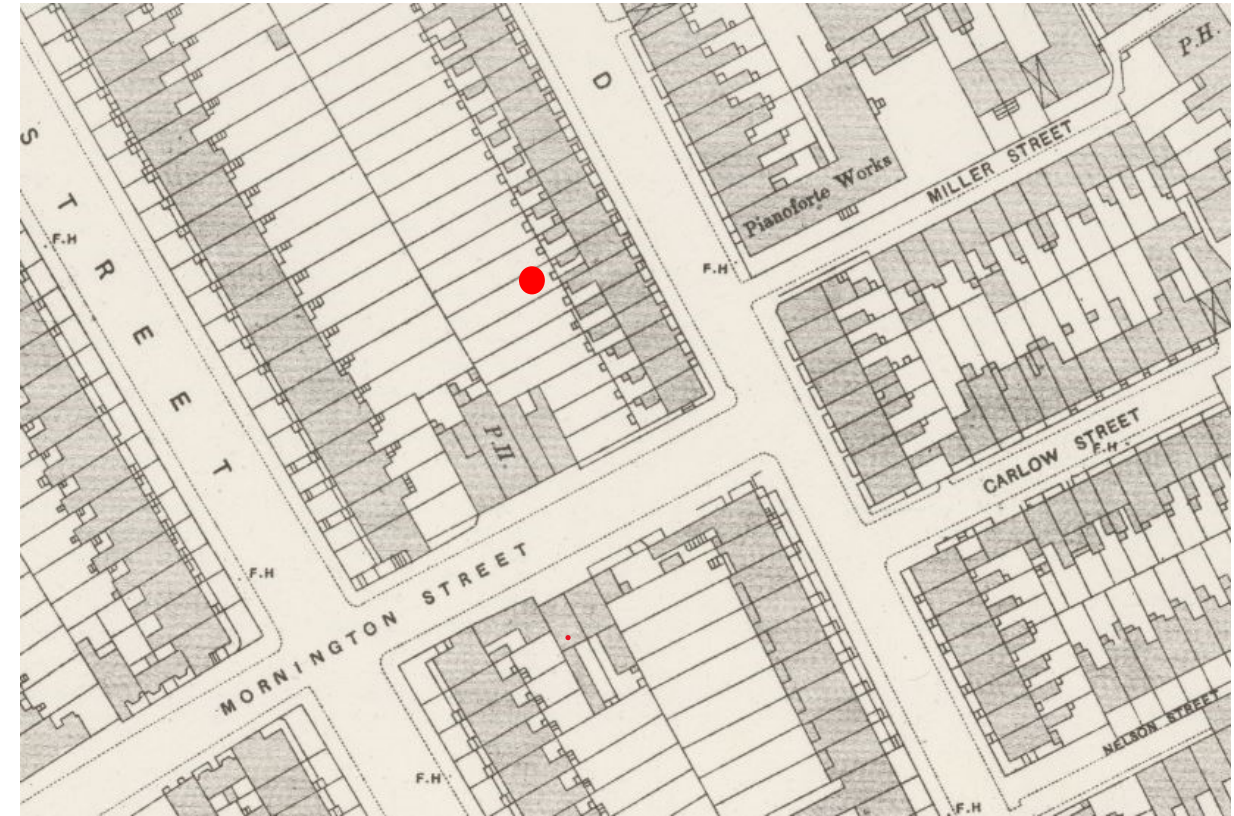
1.2 1894 OS map