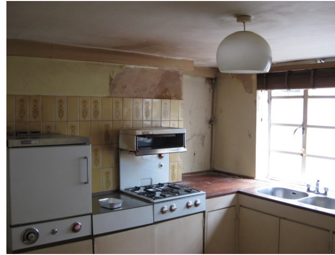
4.2 Window to lightwell