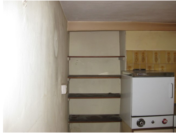
4.1 Kitchen units along party wall