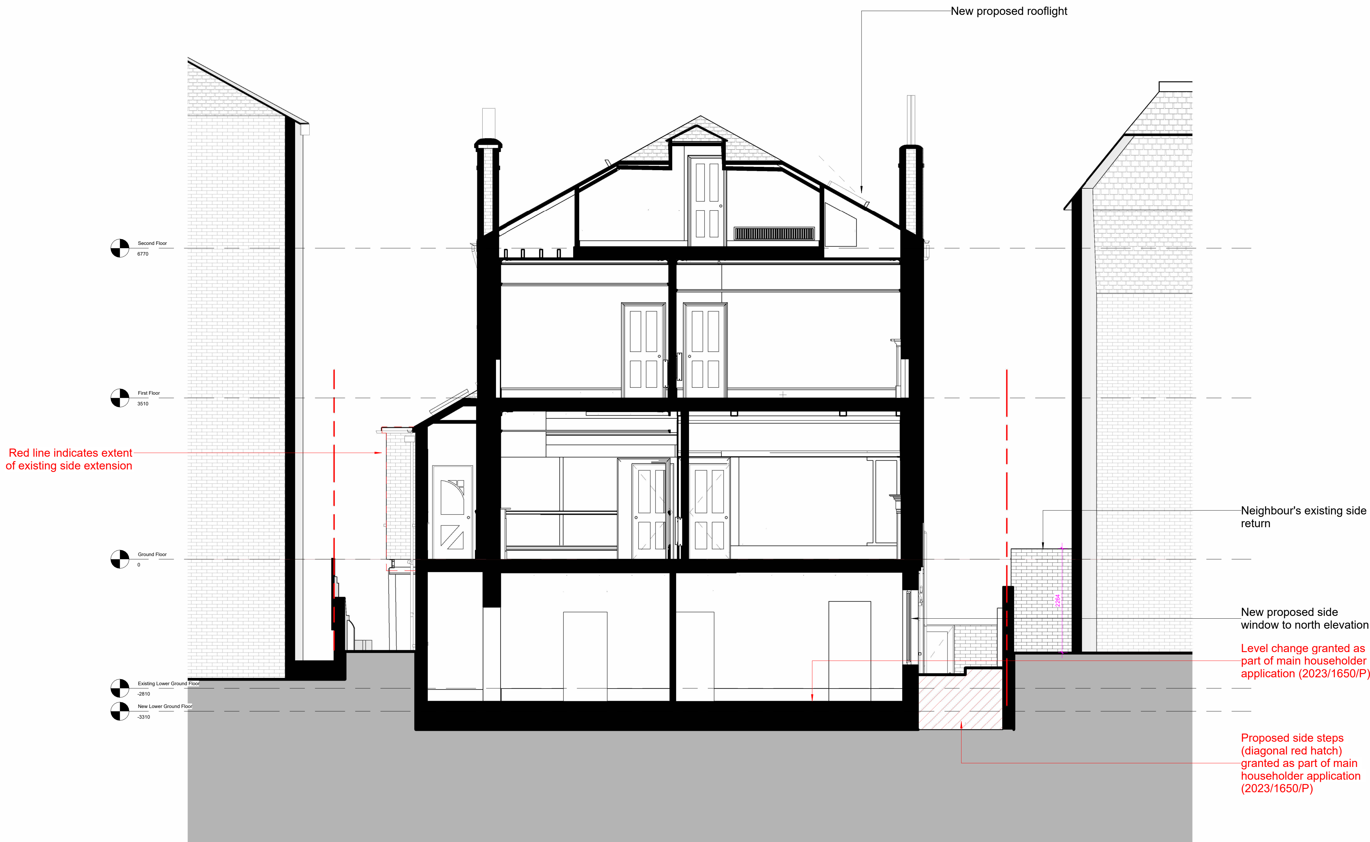
1 Section BBB - Proposed 1 : 50

15 Dartmouth Park Avenue 17 Dartmouth Park Avenue 21-23 Dartmouth Park Avenue