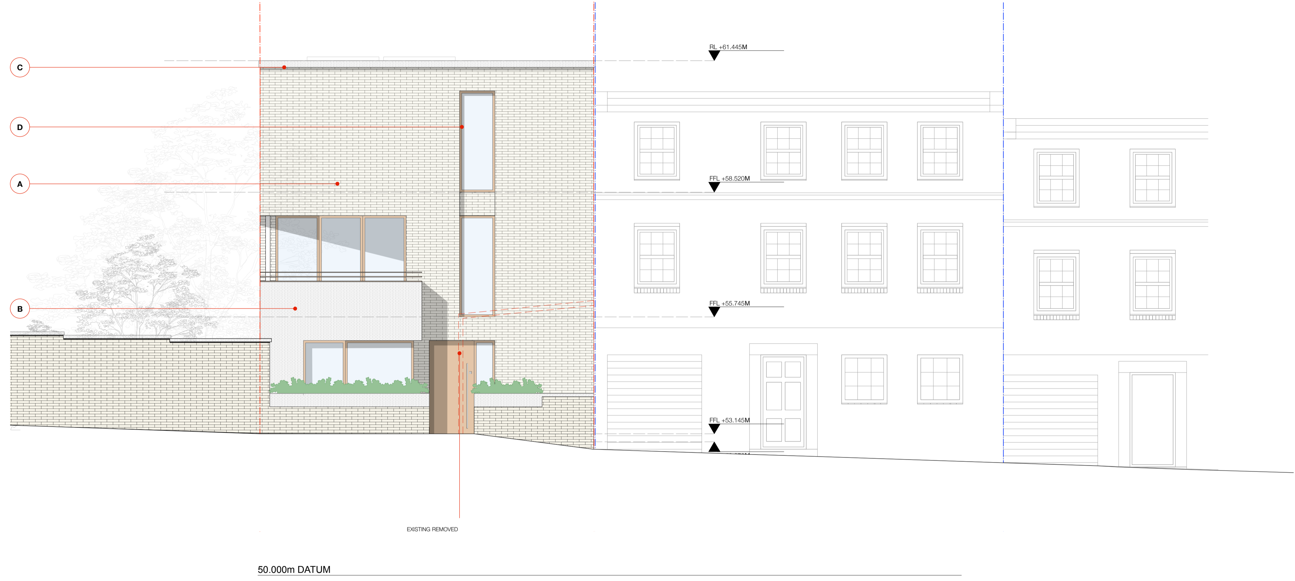
NORTH WEST ELEVATION SCALE 1:50 @ A1 / 1:100 @ A3

KEY: - - - SITE OWNERSHIP - - - RESIDENTIAL CURTILAGE - - - EXISTING TO BE REMOVED