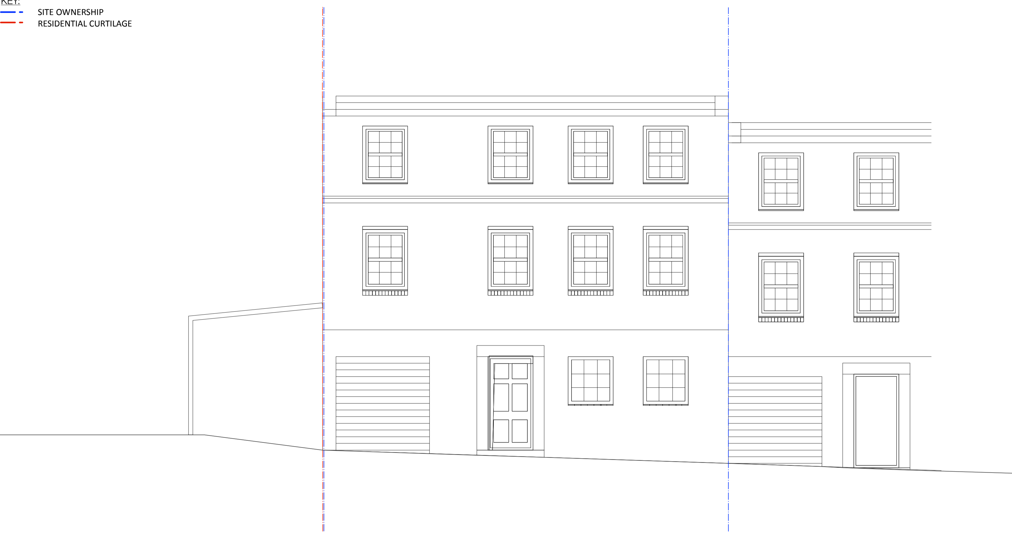
NORTH WEST ELEVATION SCALE 1:50 @ A1 / 1:100 @ A3 50.000m DATUM

KEY: - - - SITE OWNERSHIP - - - RESIDENTIAL CURTLAGE