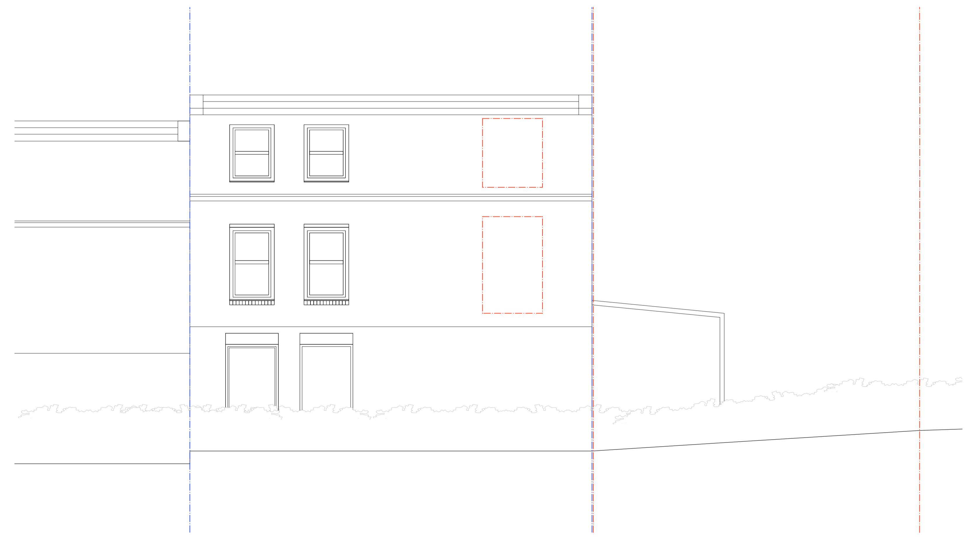
SOUTH EAST ELEVATION SCALE 1:50 @ A1 / 1:100 @ A3 50.000m DATUM