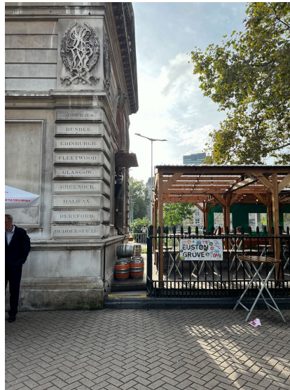
View 02 - east elevation