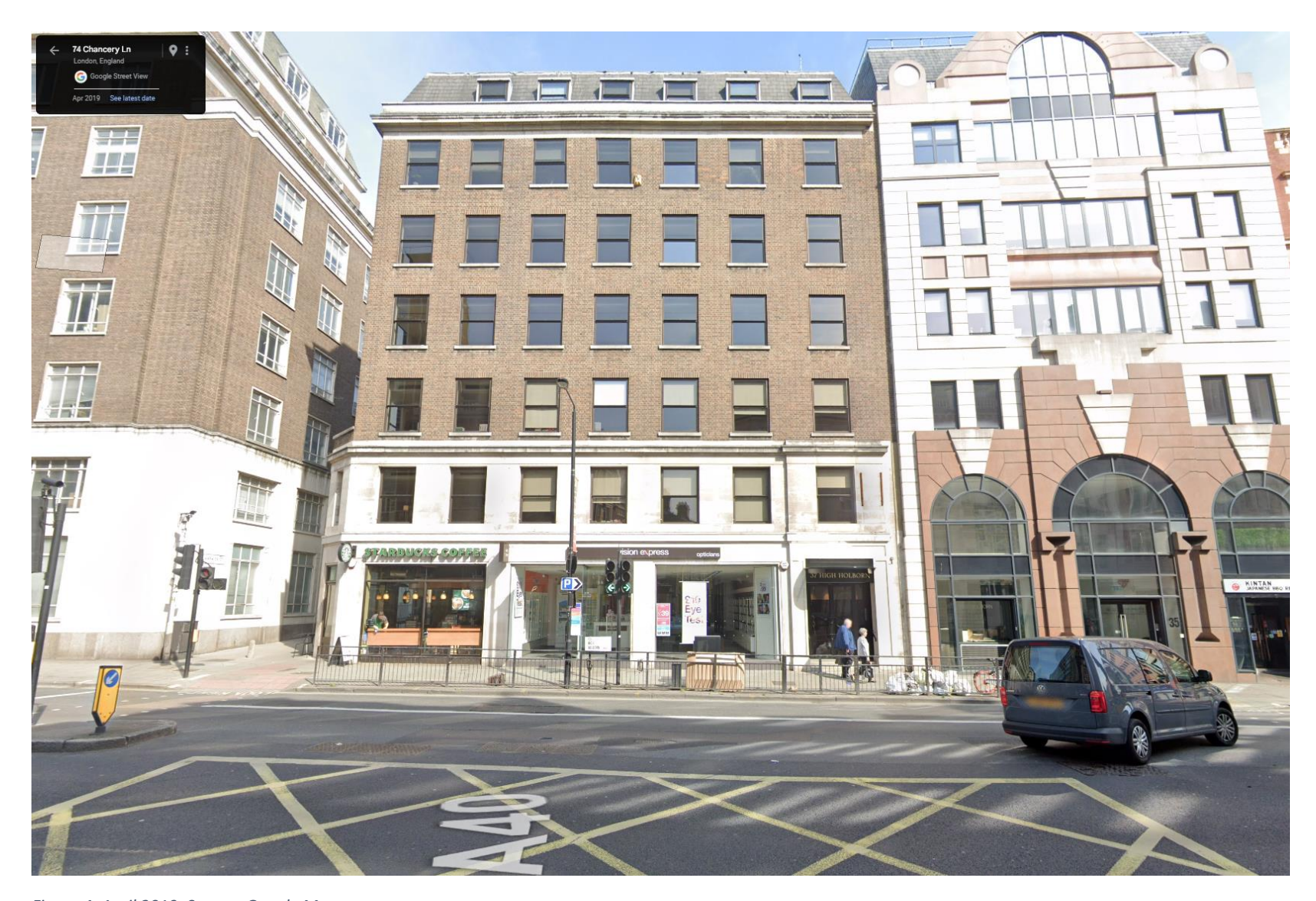
Figure 4: April 2019.