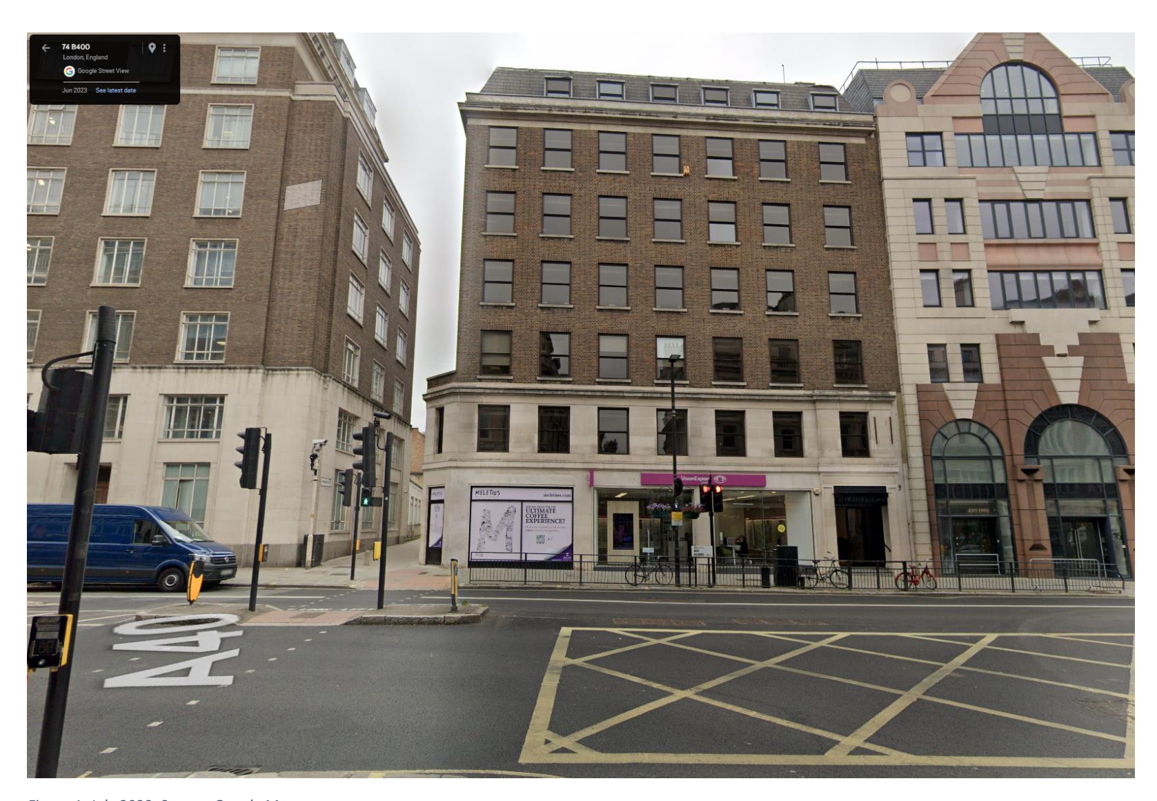
Figure 1: July 2023.