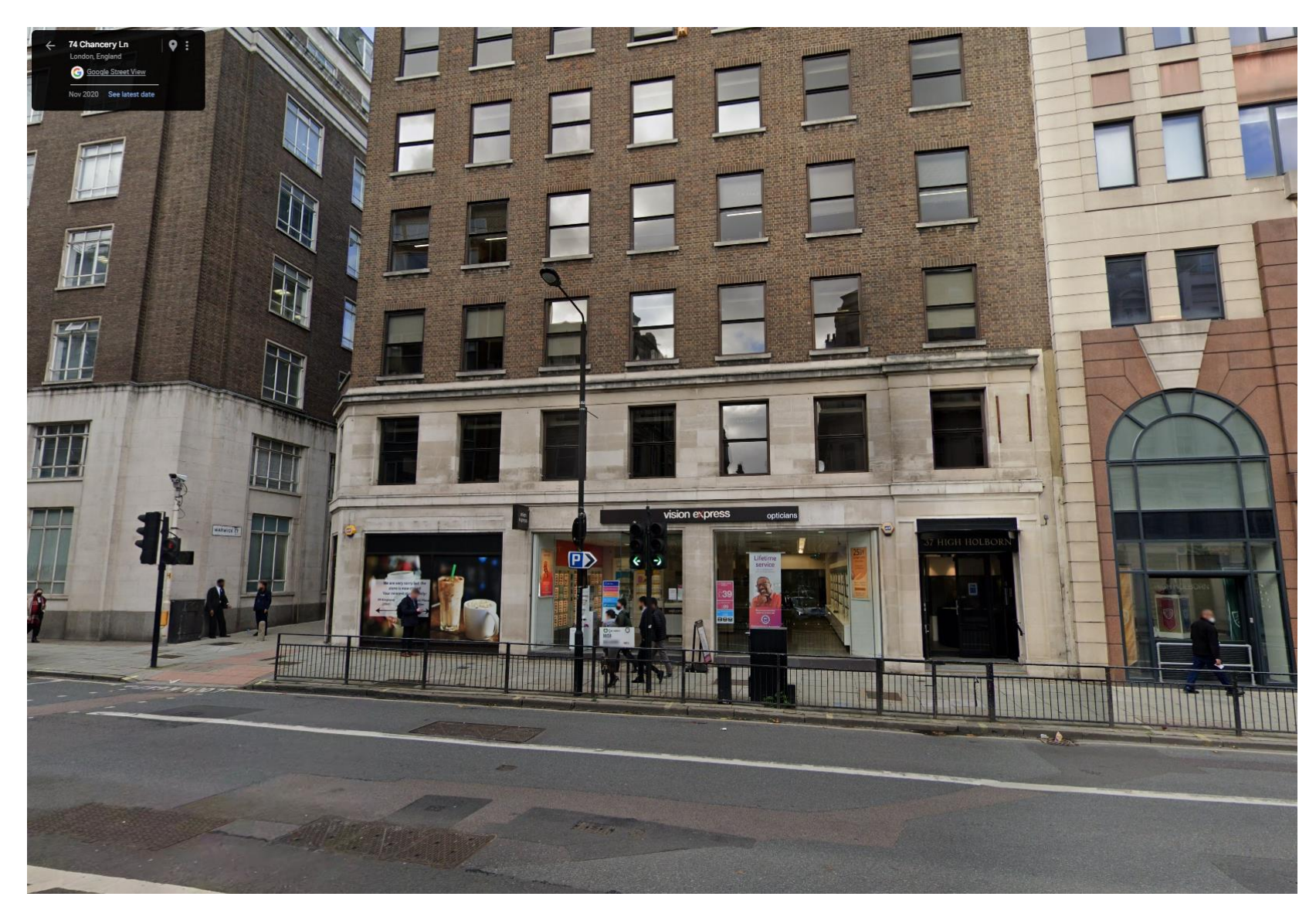
Figure 3: November 2020.