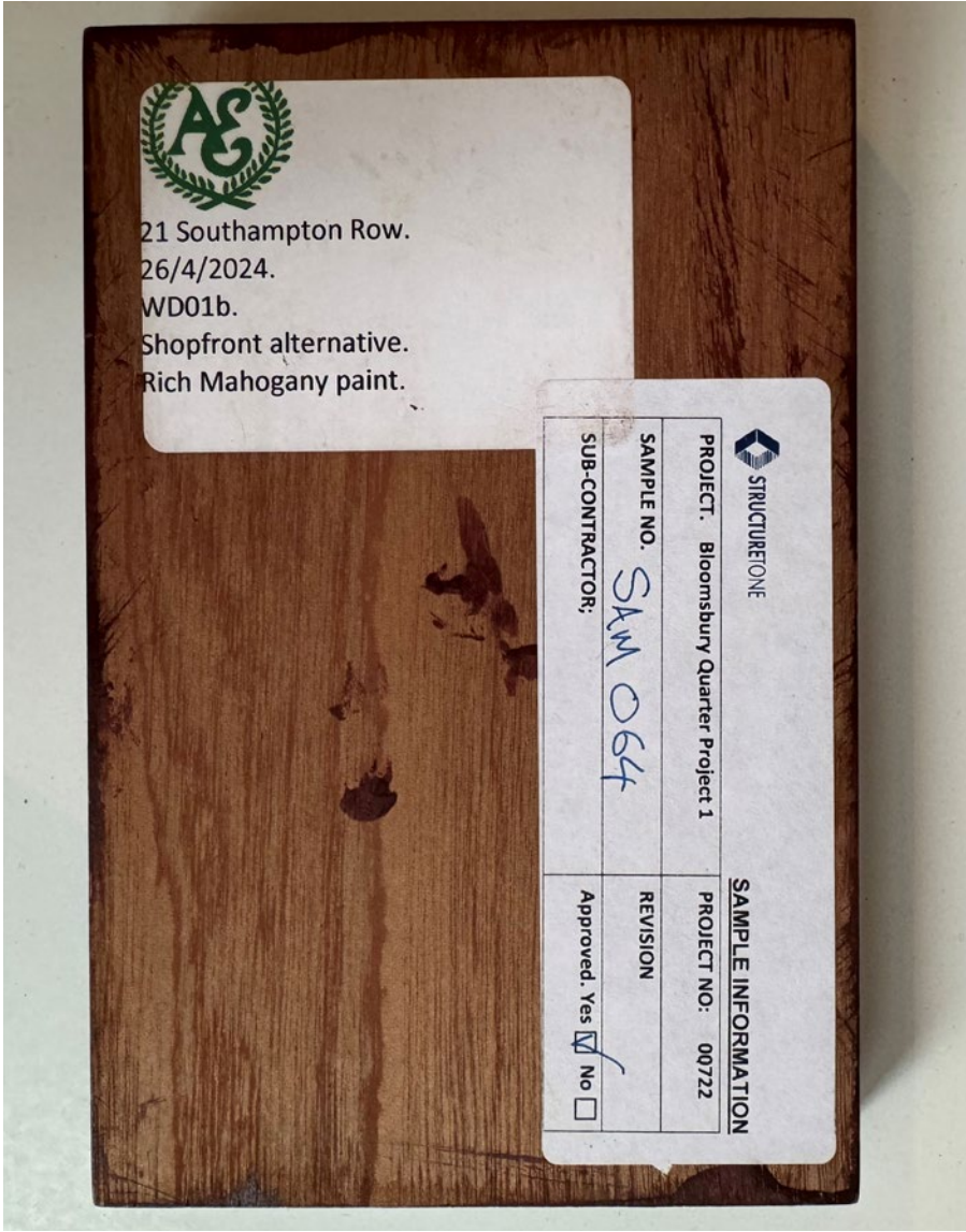
Proposed Shop Front paint colour