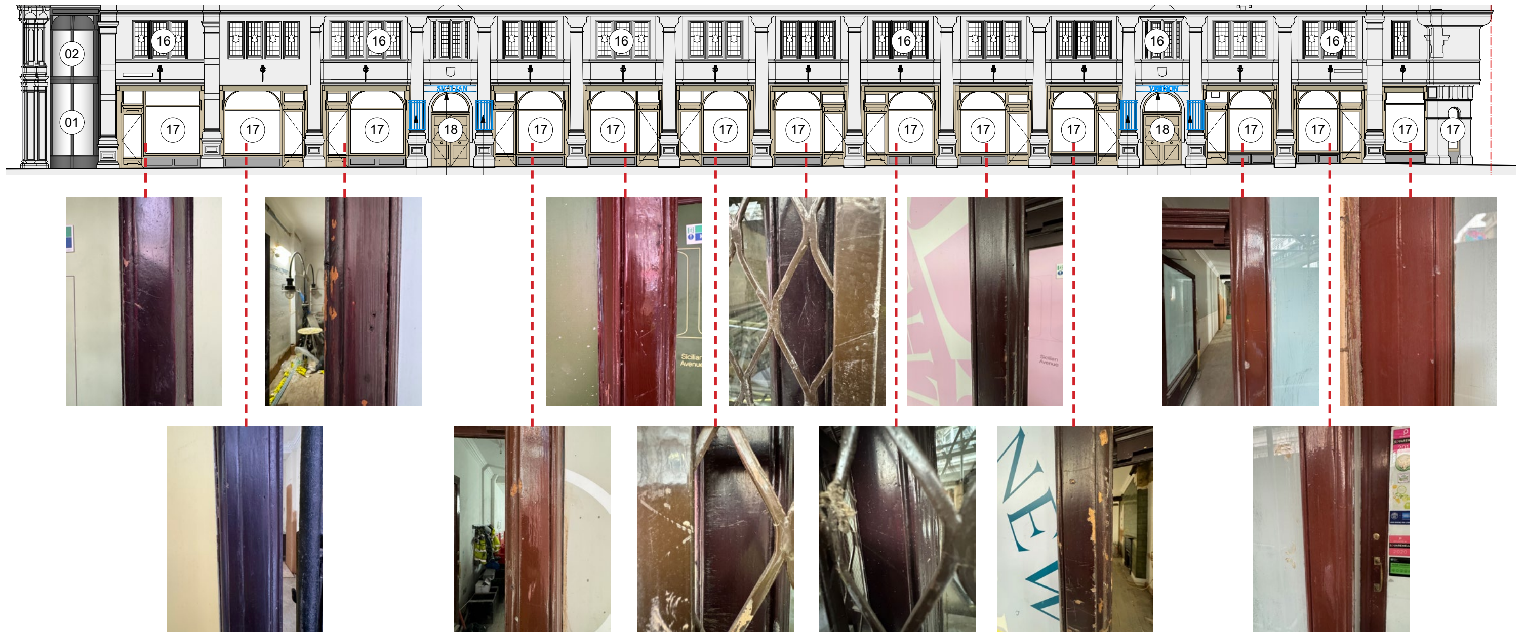
Existing Shop Front Painted Timber Work