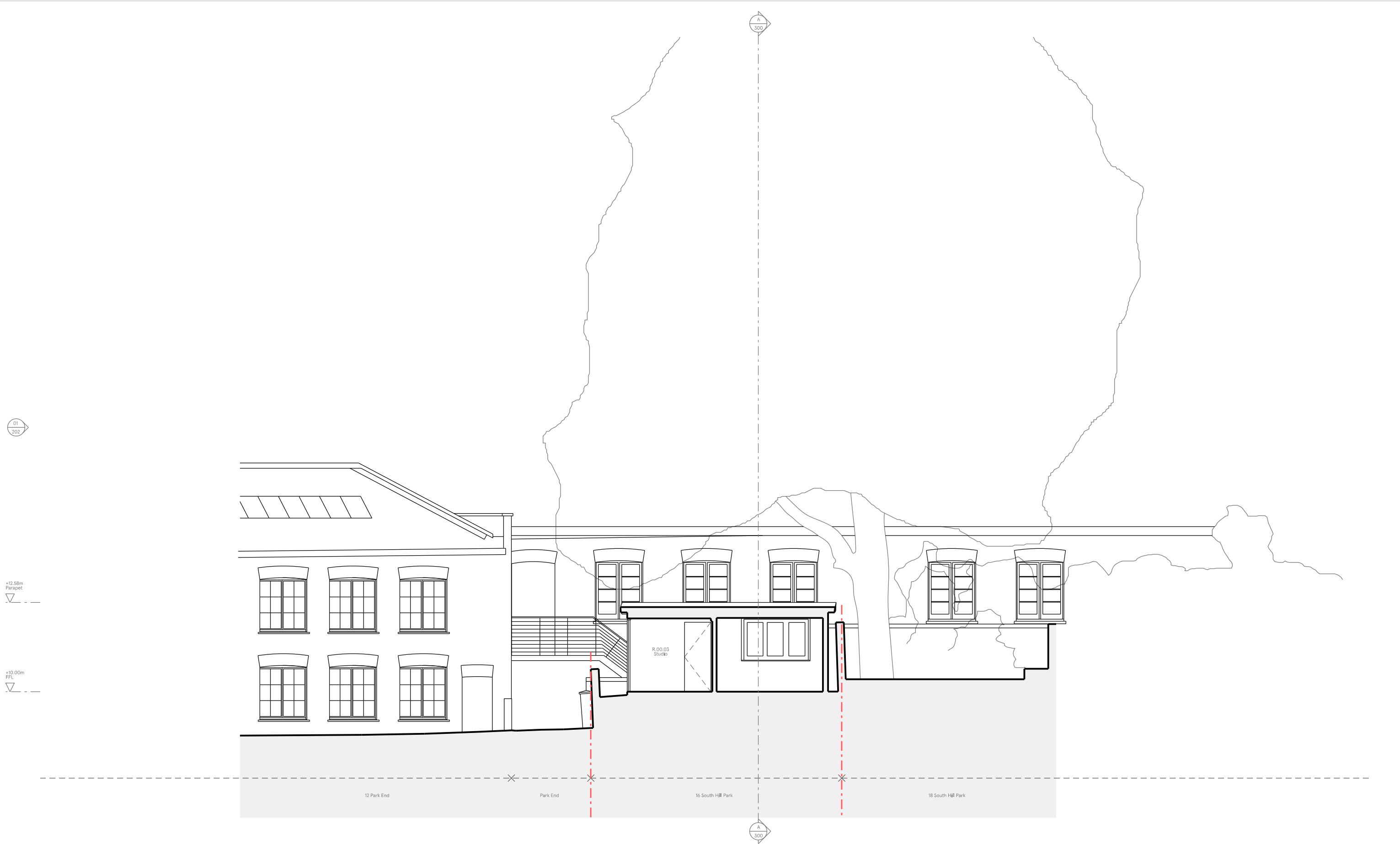
01 Section BB