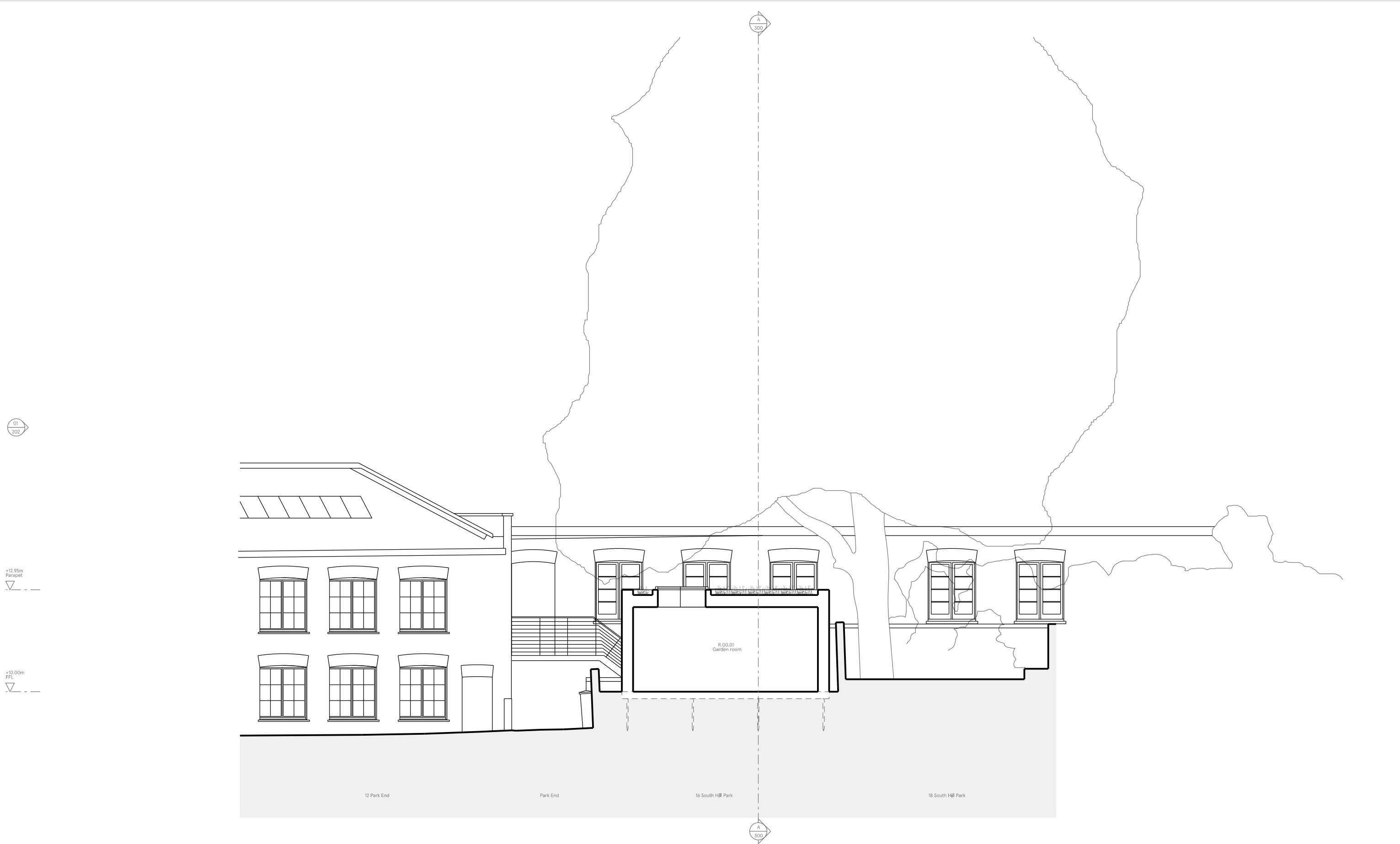
01 Section BB